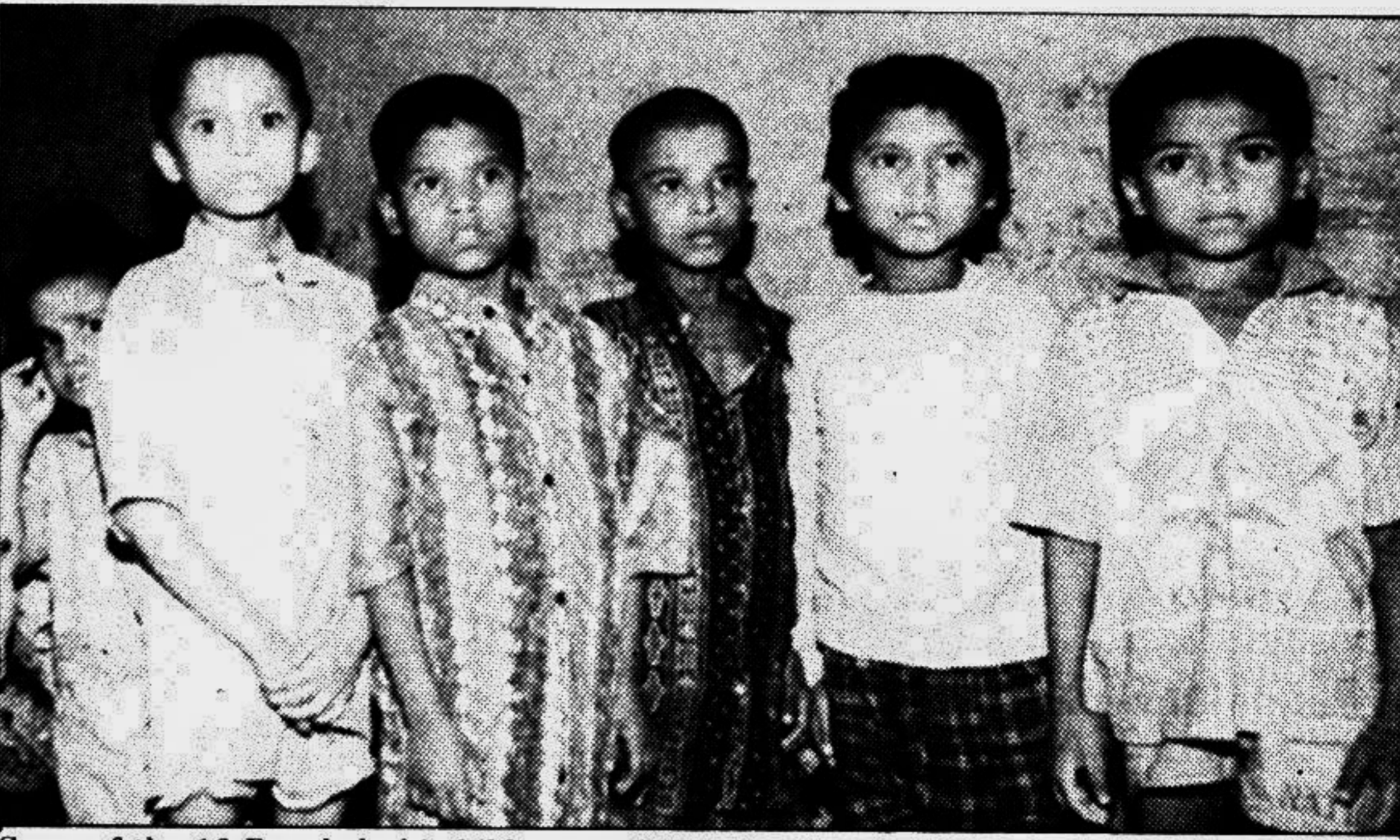
Some of the 16 Bangladeshi children aged between four and eight who appeared in a New Delhi court yesterday. Police claim they entered India without passports and were apprehended as they were being taken to Saudi Arabia, apparently to be used as jockeys in desert camel racing.

By Staff Correspondent Under the Dhaka Board, 2,18,905 students appeared in the examinations, of whom 78,352 passed. The percentage of pass is 35.79. Among the successful candidates 19,696 got first division, 50,375 second division and 8,281 third division. Of those who passed, 35.80 per cent are male and 35.78 per cent are female students. The top three positions in the combined merit list of Science, Agri Science and Home Economics group were secured by candidates from Dhaka College. Mohammad Shafiqul Alam of Dhaka College stood first in the merit list of the group, securing 943 marks. Faisal Ibne Rezwana and Nabil Imran Siddiquee of the same college got the second and third positions with 941 and 939 marks respectively. In the combined merit list of Humanities, Islamic Studies and Music group, Sabrina M Shaila of the Rifles Public School and College stood first, scoring 883 marks. She was followed by Mosammat Nelema Akter of Viharunissa Noon College with 864 marks. The third position went to Badal Chandra Baroi of DK Sayed Athar Al Academy and College. He scored 862 marks. Anisur Rahman Faroque of See Page 12 Col 1