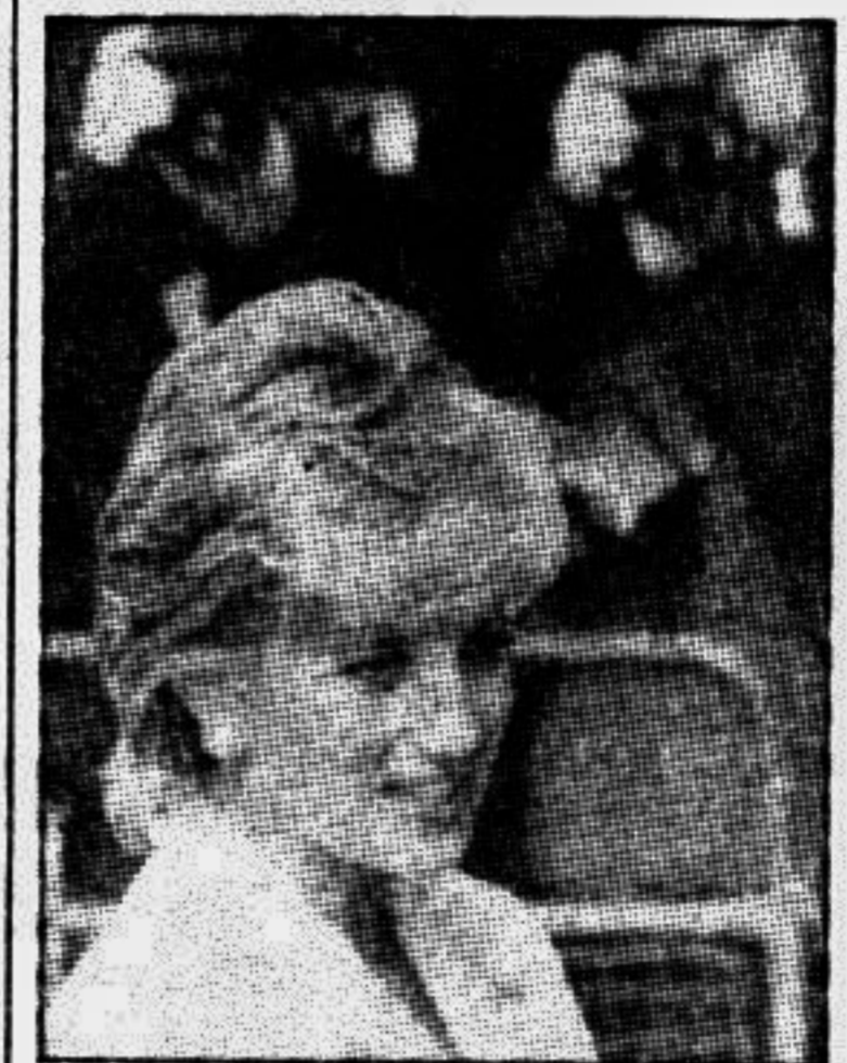
Glories of death

THE most-loved, admired and charismatic personality and one of the most elegant women of today's world, "The Queen of the People's Heart" as she aspired to be called, Diana, the Princess of Wales, is no more there to traverse this earth, hopping from continent to continent, from one country to another, on