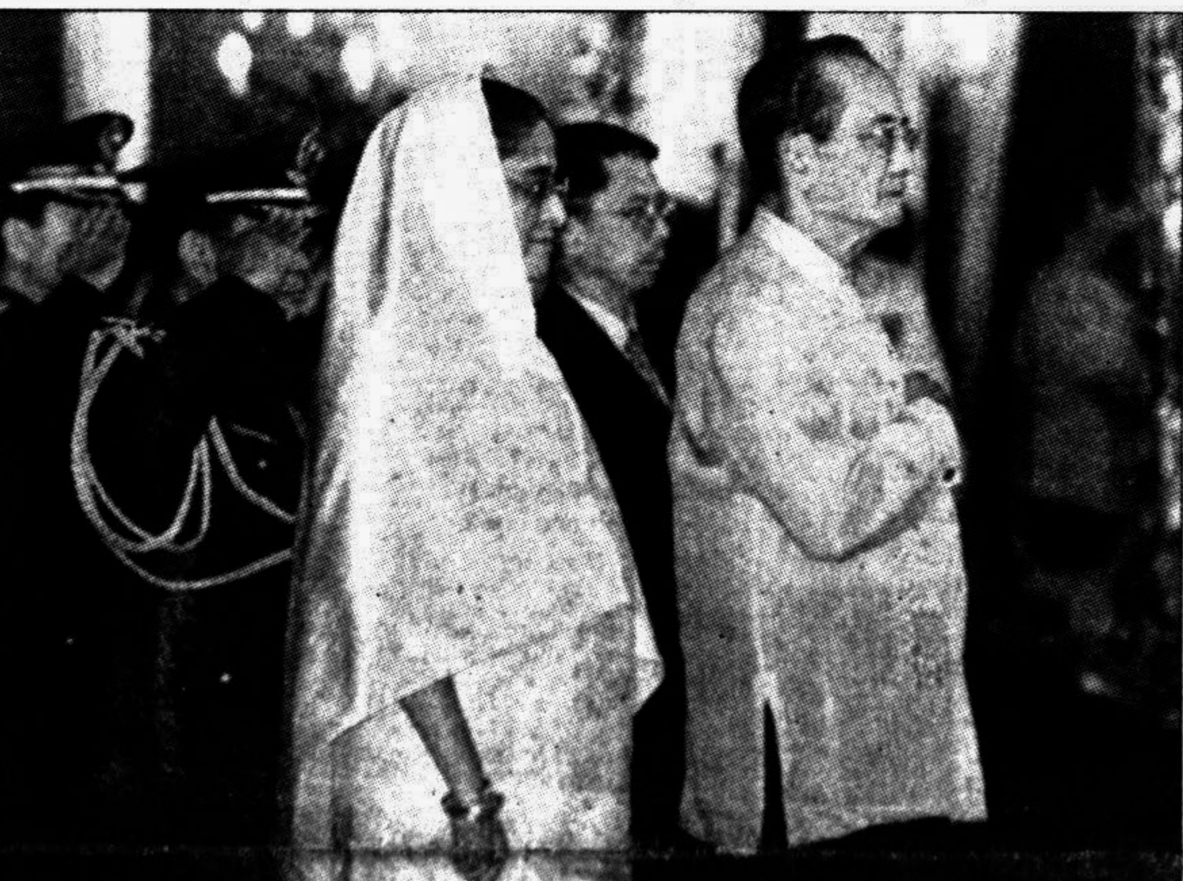
Prime Minister Sheikh Hasina (L) and Philippine President Fidel Ramos stand at attention during a guard of honour for the Bangladesh leader on her arrival at Malacanang Palace in Manila yesterday.

business delegation would pave the way for more private sector cooperation. The Bangladesh leader referred to the formation of an economic forum comprising India, Sri Lanka, Thailand and Bangladesh and said it was further enhanced with the inclusion of Myanmar as a member on August 28 and the group has been renamed BISMEC. Later at a press conference Sheikh Hasina said there is a great potential for further development and expansion of relations between Dhaka and Manila. President Ramos referred to See Page 12 Col 2