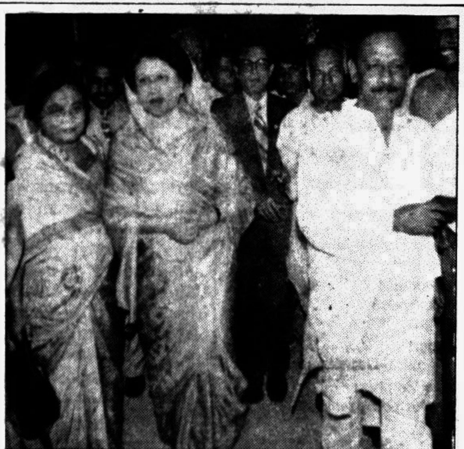
BNP chairperson and Leader of the Opposition in Jatiya Sangsad Begum Khaleda Zia was received by party leaders at Zia International Airport on her return from the US yesterday.

By Staff Correspondent BNP chief and Leader of the Opposition in the Jatiya Sangsad Begum Khaleda Zia was warmly received by party-men yesterday at the Zia International Airport (ZIA) on her return home after a 15-day tour to Pakistan and the USA. Thousands of her party workers and supporters assembled at the airport to welcome back the BNP chairperson. The supporters, many of them carrying bouquets, started chanting slogans hailing the BNP chief as the Biman aircraft she flew in landed at ZIA at around 5:30 in the morning. BNP Secretary General Abdul Mannan Bhuiyan, MP, flanked by other top leaders of the party, greeted Begum Zia with a bouquet as she disembarked from the Biman aircraft that flew from the John F Kennedy airport in New York. To receive their leader, the BNP supporters travelling in See Page 12 Col 7