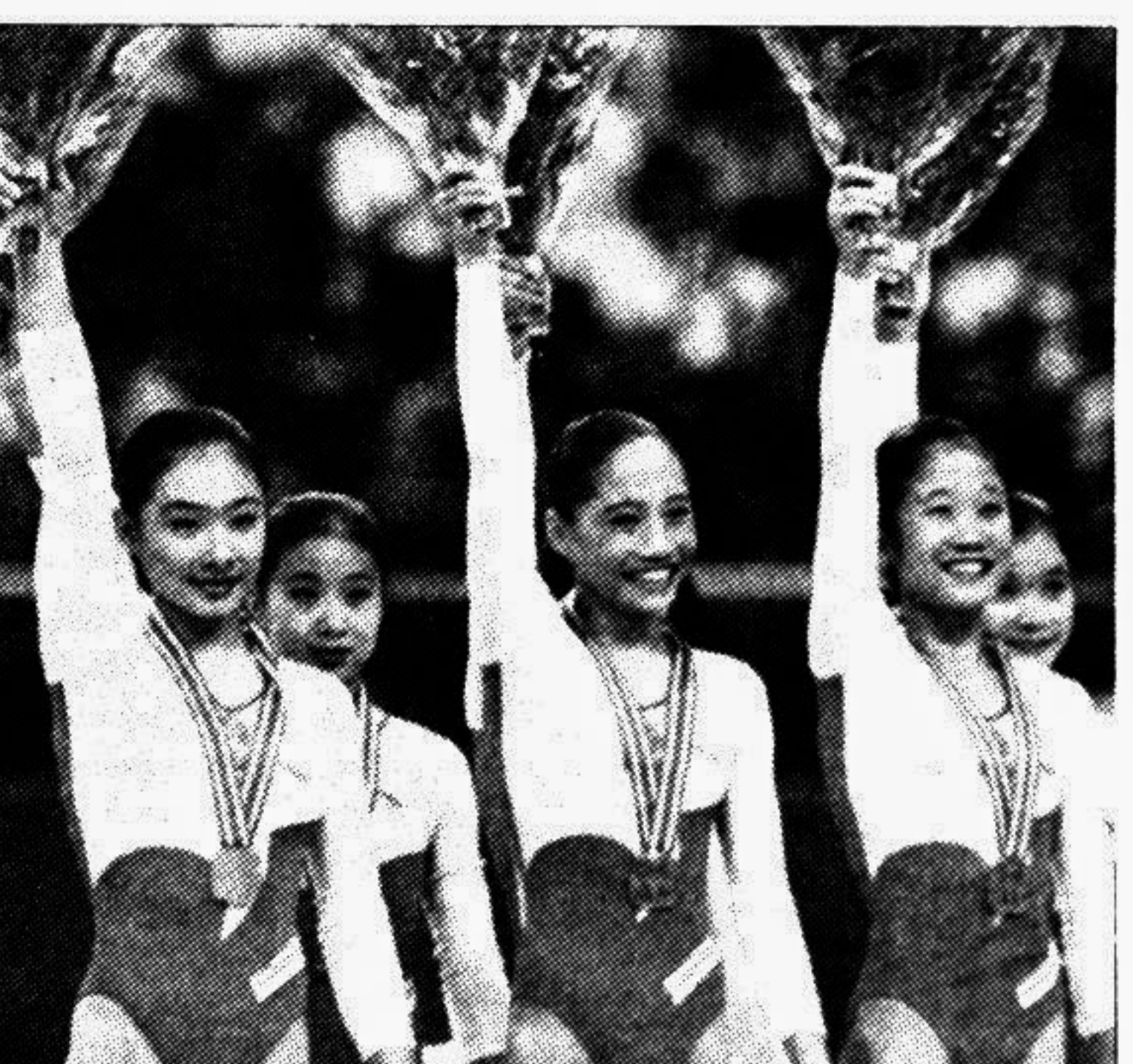
Members of the Chinese women's team acknowledge the crowd's applause after being decorated with the bronze medal in the team event at the World Gymnastics Championships in Lausanne, Switzerland on Sept 4.

The United States, with only one member, Dominique Monceanu, left from the team that took gold in Atlanta, suffered from lack of experience, finishing sixth.