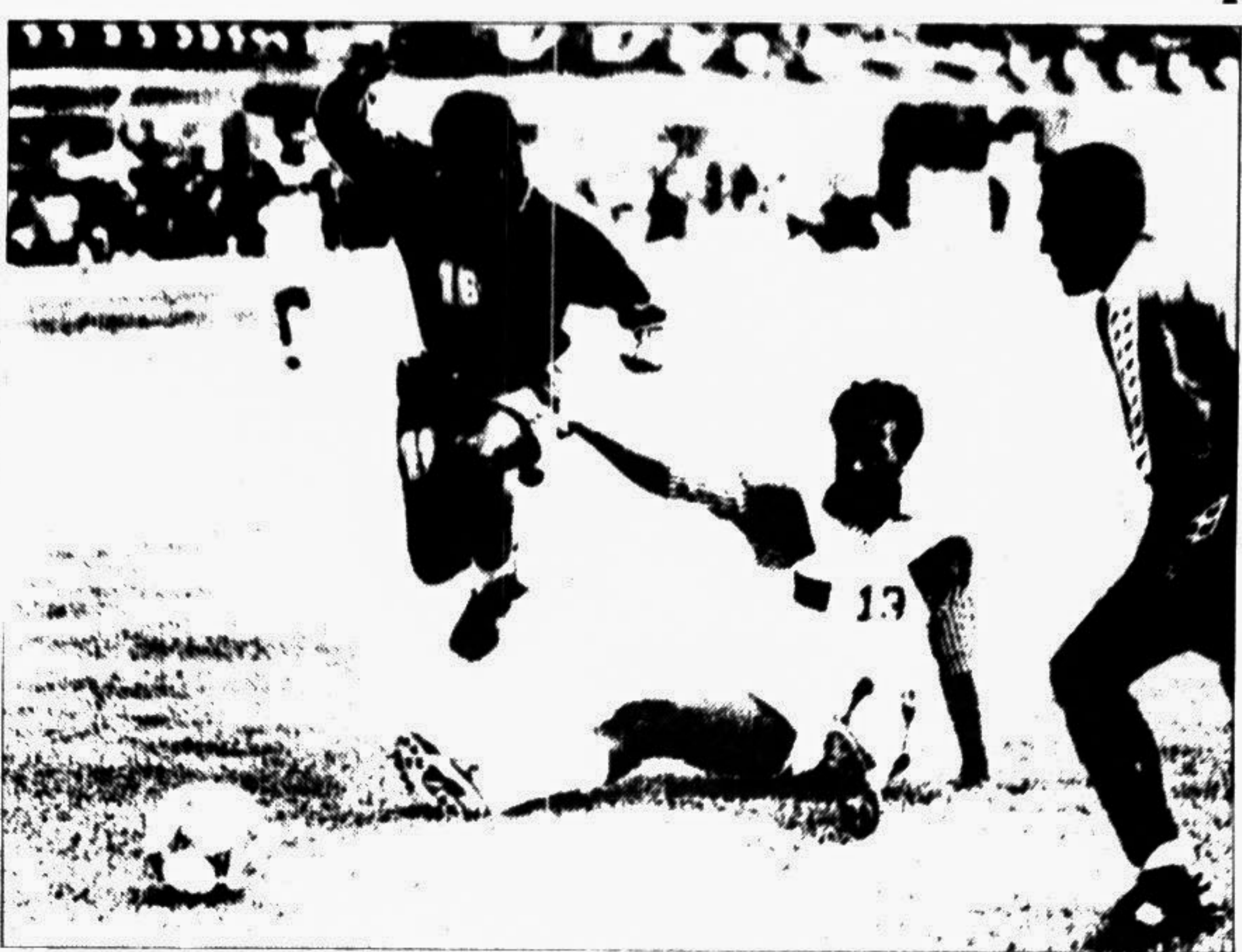
Action from yesterday SAFF Championship clash between Bangladesh and Maldives in the Nepalese capital Kathmandu. The match ended in a 1-1 draw.

Earlier, Le Havre held 1-1 at home by Toulouse. Both teams had a player sent off in the second half.