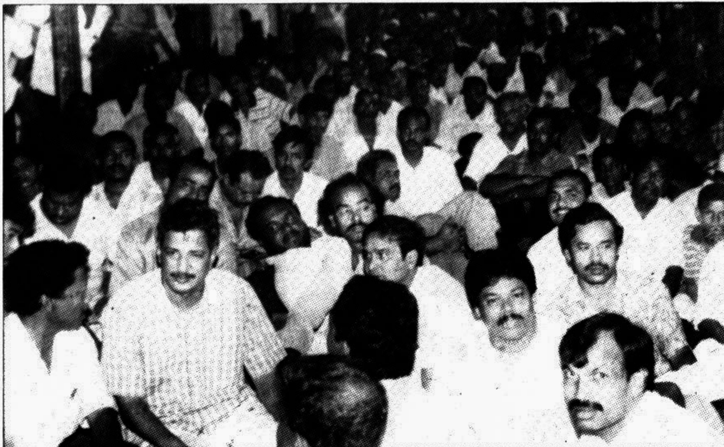
RAJSHAHI: Several hundred people gheraoed the office of the Deputy Commissioner (DC), Rajshahi and staged a sit-in demonstration recently in protest against authorities' decision to withdraw the Head Office of Bangladesh Railway Western Zone from Rajshahi.

Only two fire stations — one in the town and another in Lakshman thana — are to cover the 12 thanas of the district.