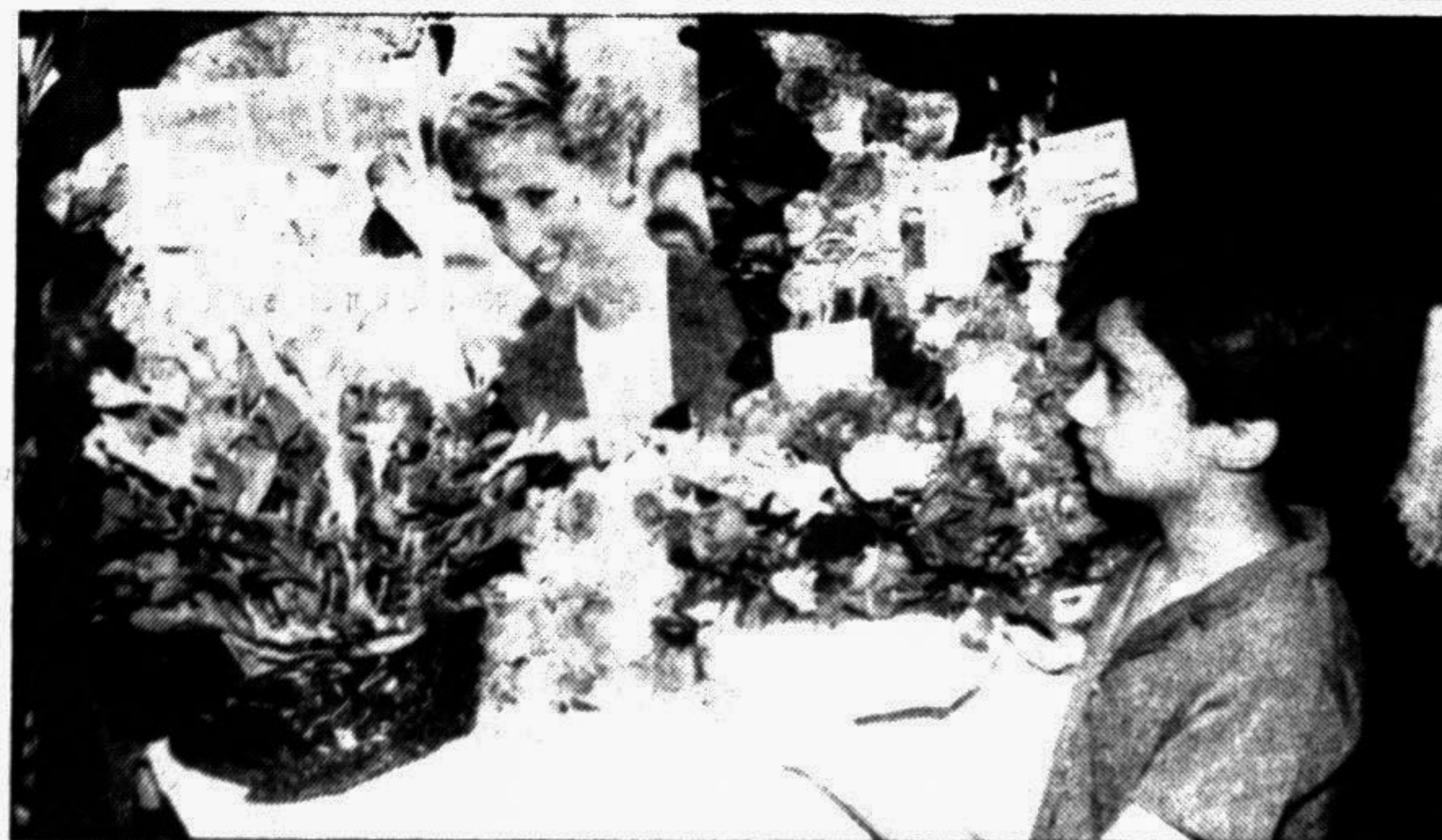
A child showing respect to Diana by placing wreath in front of the portrait of Princess of Wales at British High Commission yesterday.

KHULNA, Aug 5: Khulna Metropolitan Police (KMP) recorded 973 criminal cases in the city during the last eight months ending August 31 last, reports BSS.