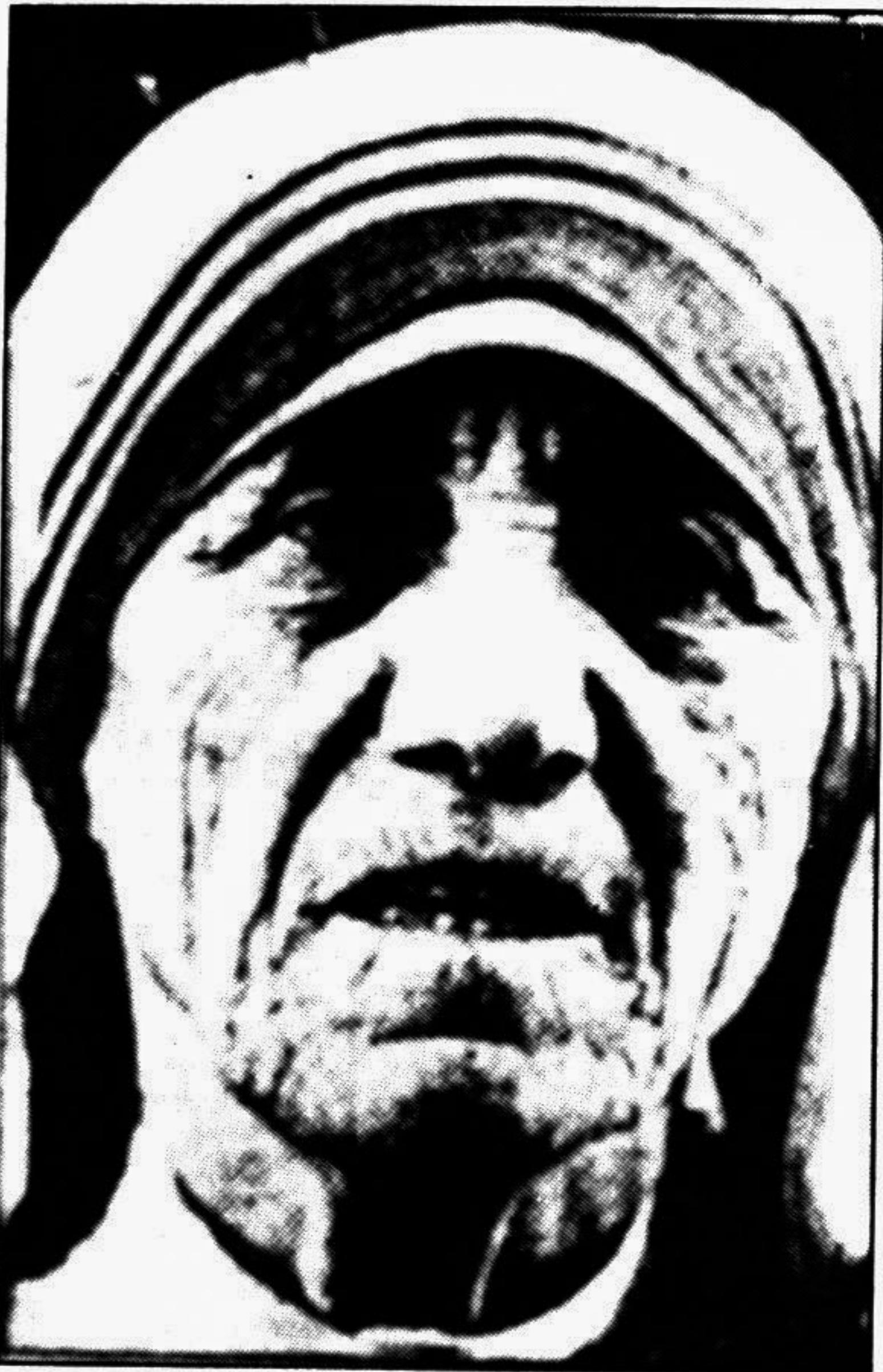
Mother Teresa — champion of the world's poor — died of cardiac arrest in Calcutta yesterday. — File photo

CALCUTTA, Sept 5: Mother Teresa died today of cardiac arrest in her religious order's headquarters in eastern India, an order spokeswoman said, report agencies.