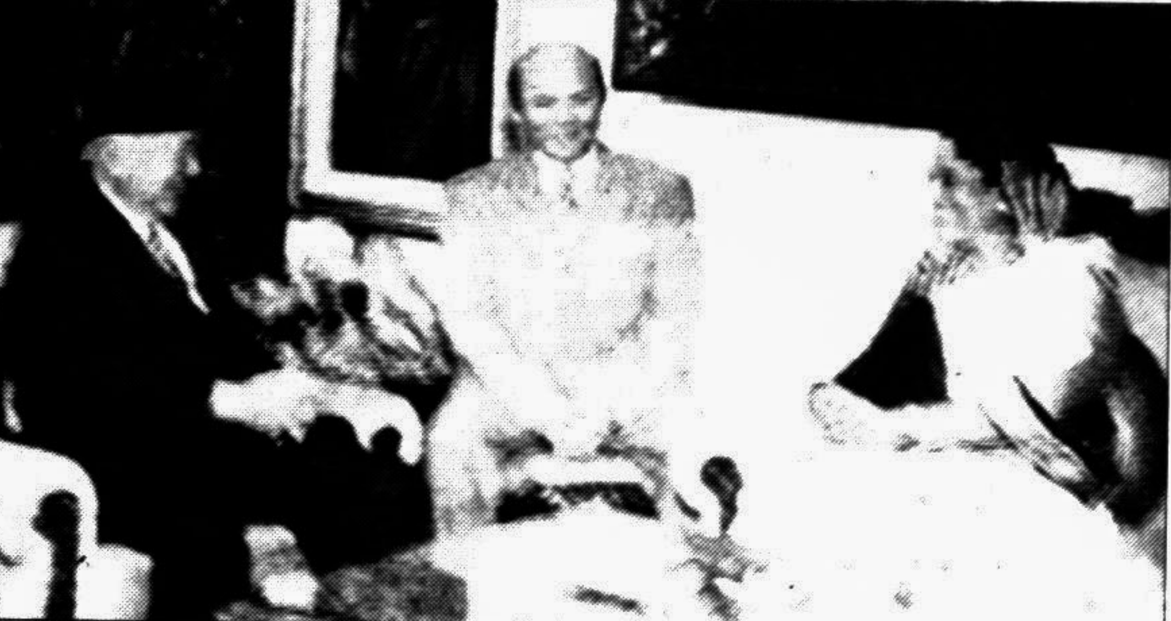
Prime Minister Sheikh Hasina holding exclusive talks with Indonesian President Soeharto in Jakarta yesterday.