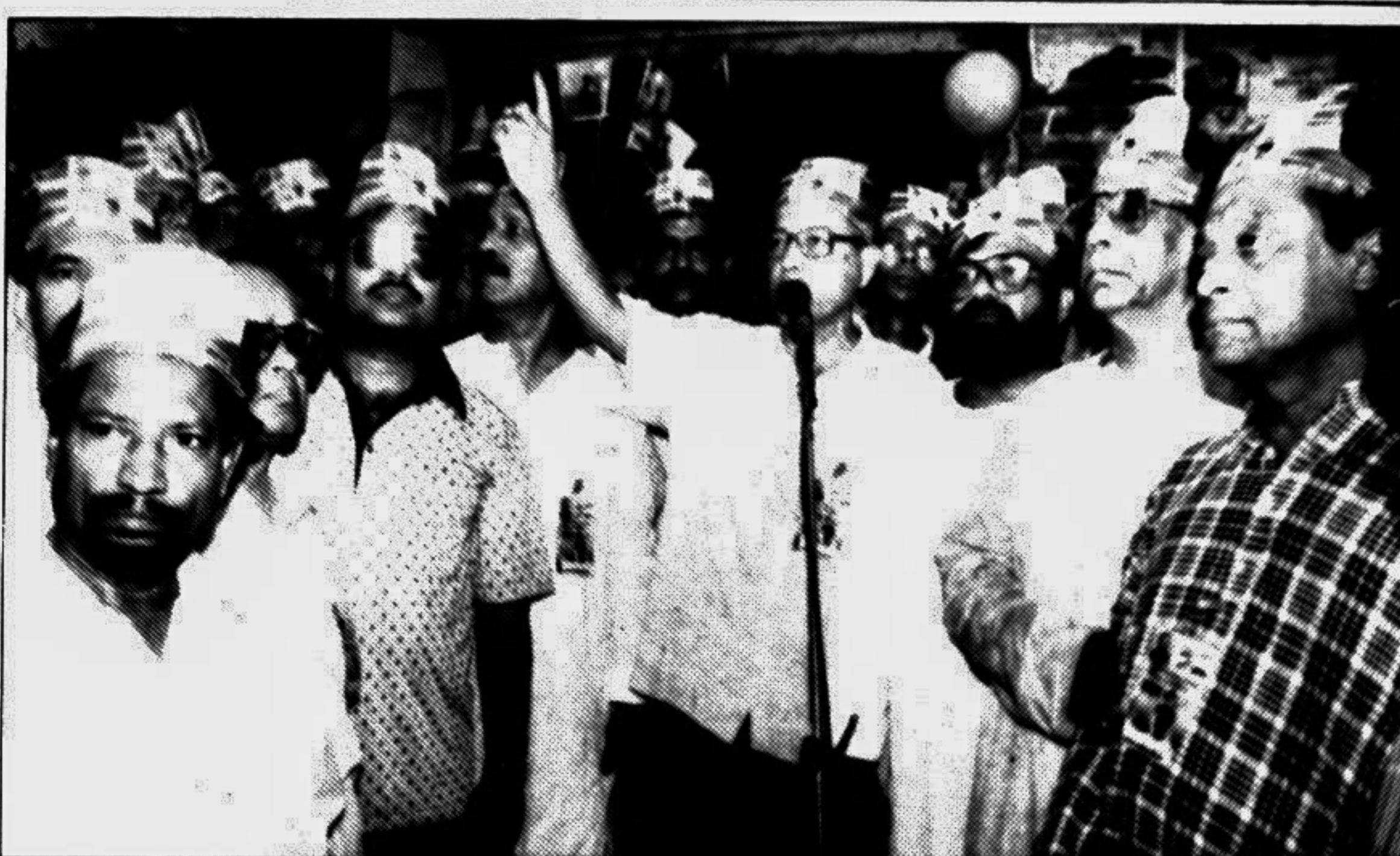
BNP leader Prof. Badruddoza Chowdhury addressing party workers in front of its central office in the city yesterday before bringing out a procession to mark the party's 19th founding anniversary.

For more information call-Dhaka: 9668114, 807687, 807771, Chittagong: (031) 712127, Khulna: (041) 725008, N. Ganj: (871) 74336