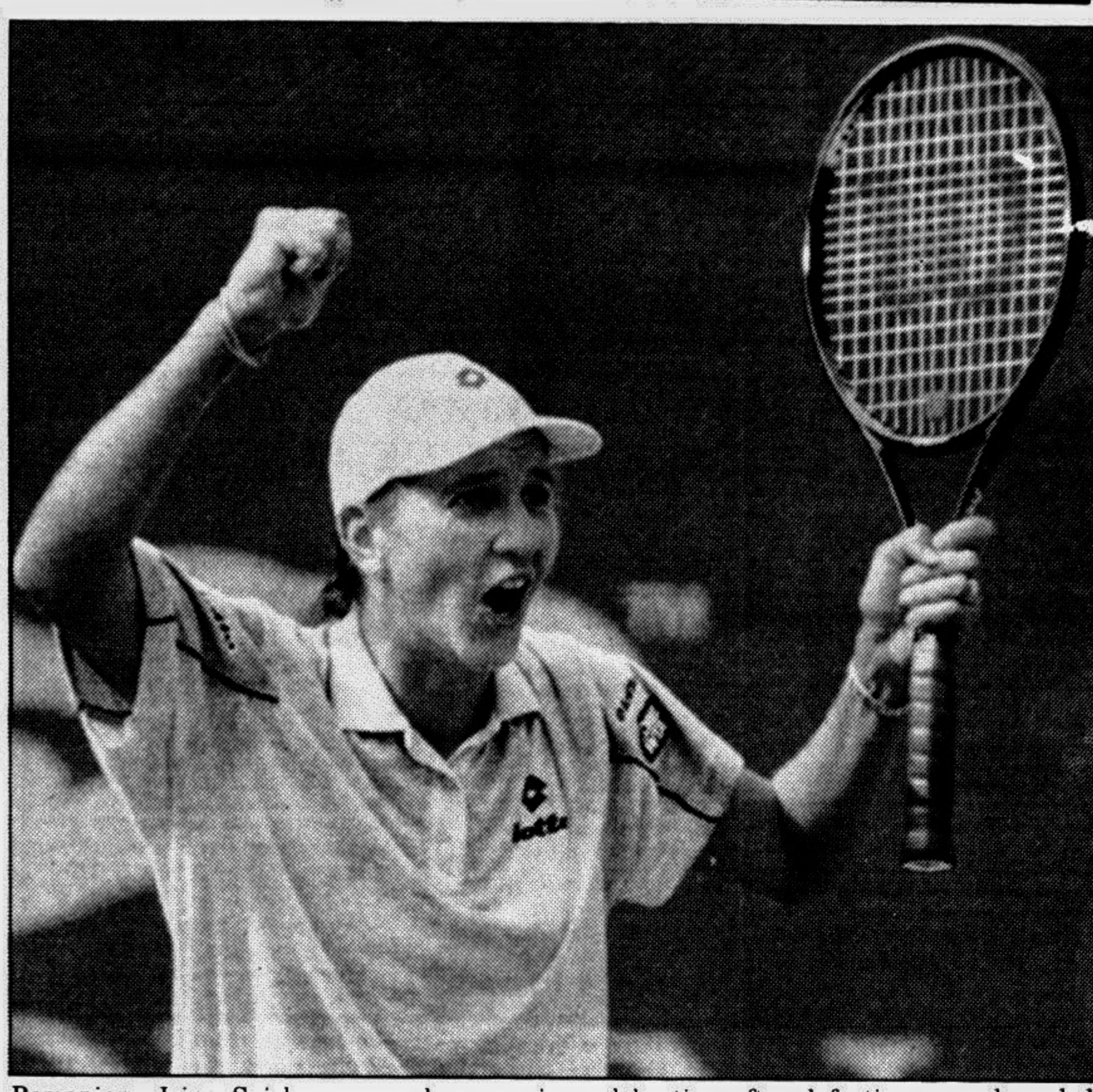
Romanian Irina Spirlea pumps her arm in celebration after defeating second seeded American Monica Seles in the quarterfinals of the US Open in New York on Sept 2.

The team's win over Congo last month, which qualified it for the finals for the first time, represented yet another milestone for South Africa's re-entry into international sports after apartheid ended in 1994.