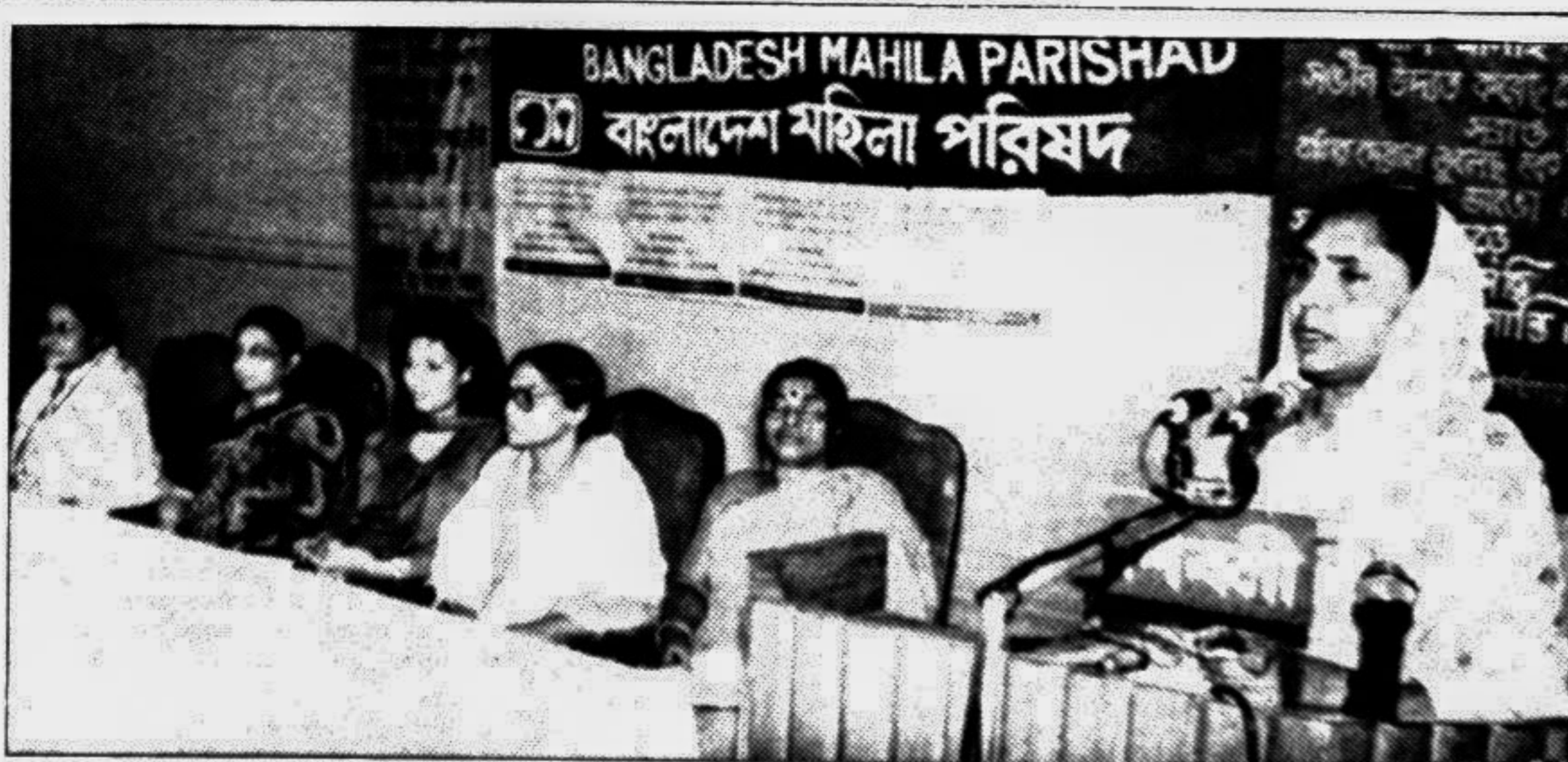
Agriculture Minister Motia Chowdhury addressing a discussion organised by Bangladesh Mahila Parishad marking the CEDAW implementation day at the Jatiya Press Club yesterday.

Discussion: Jatiyatabadi Krishak Dal will hold a discussion marking the 19th founding anniversary of BNP. Venue: BNP central office. Time: 4 pm.