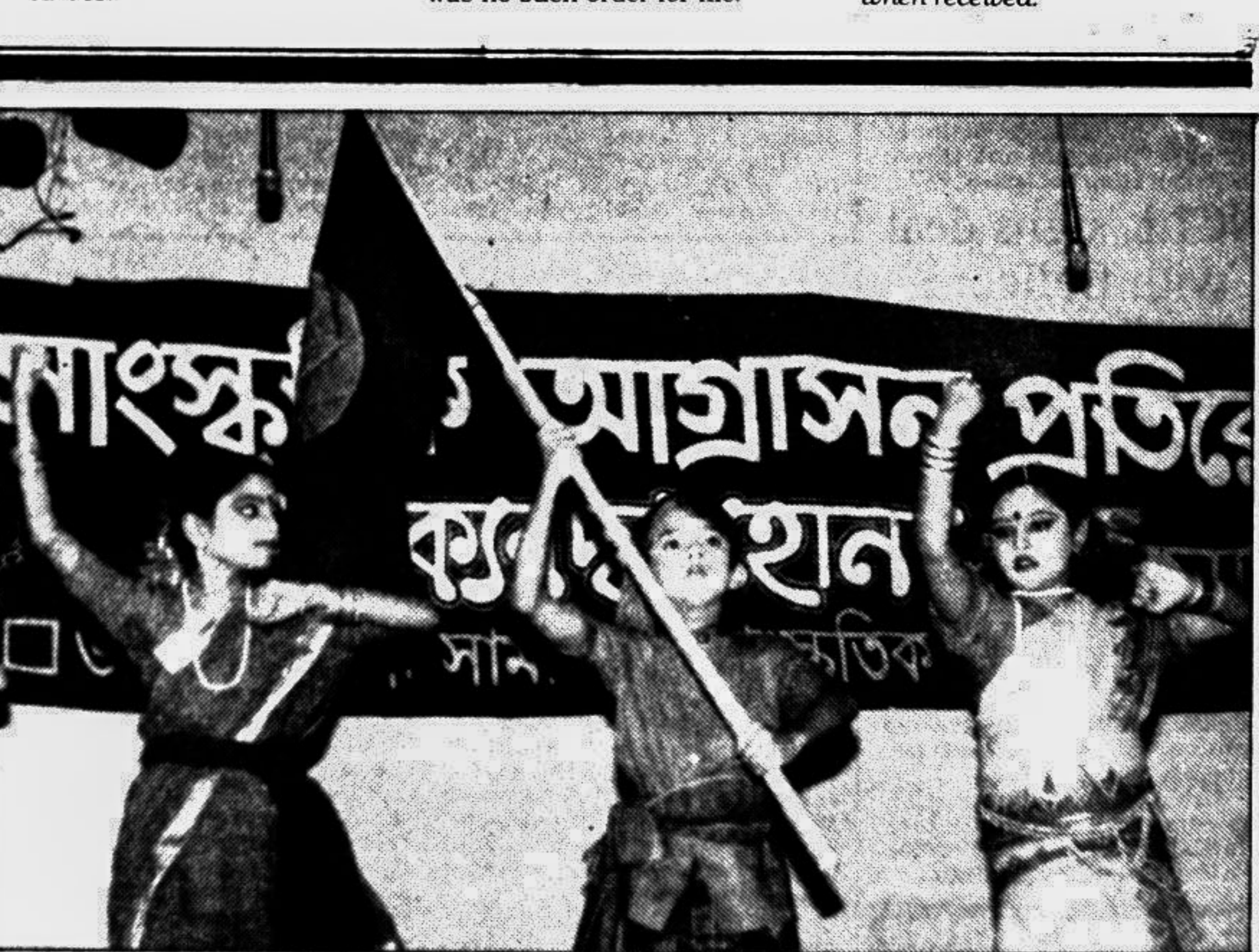
A cultural function was organised by JASAS marking the 19th founding anniversary of BNP in front of the BNP central office yesterday.