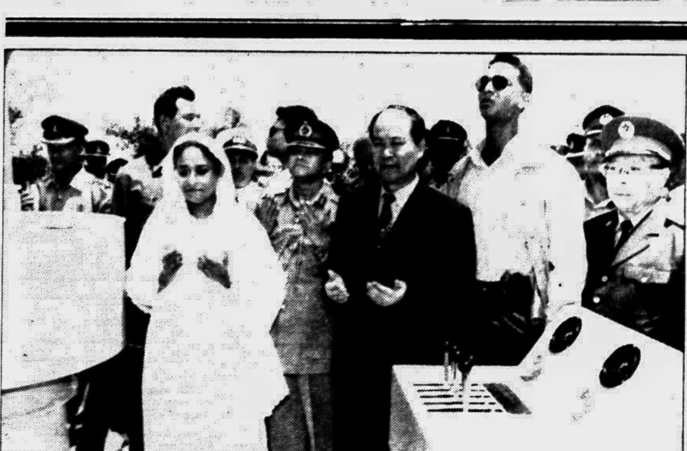
Prime Minister Sheikh Hasina offering munajat after launching the landing craft tank (LCT) Bir Shrestha Jahangir at Postagola in the city yesterday.