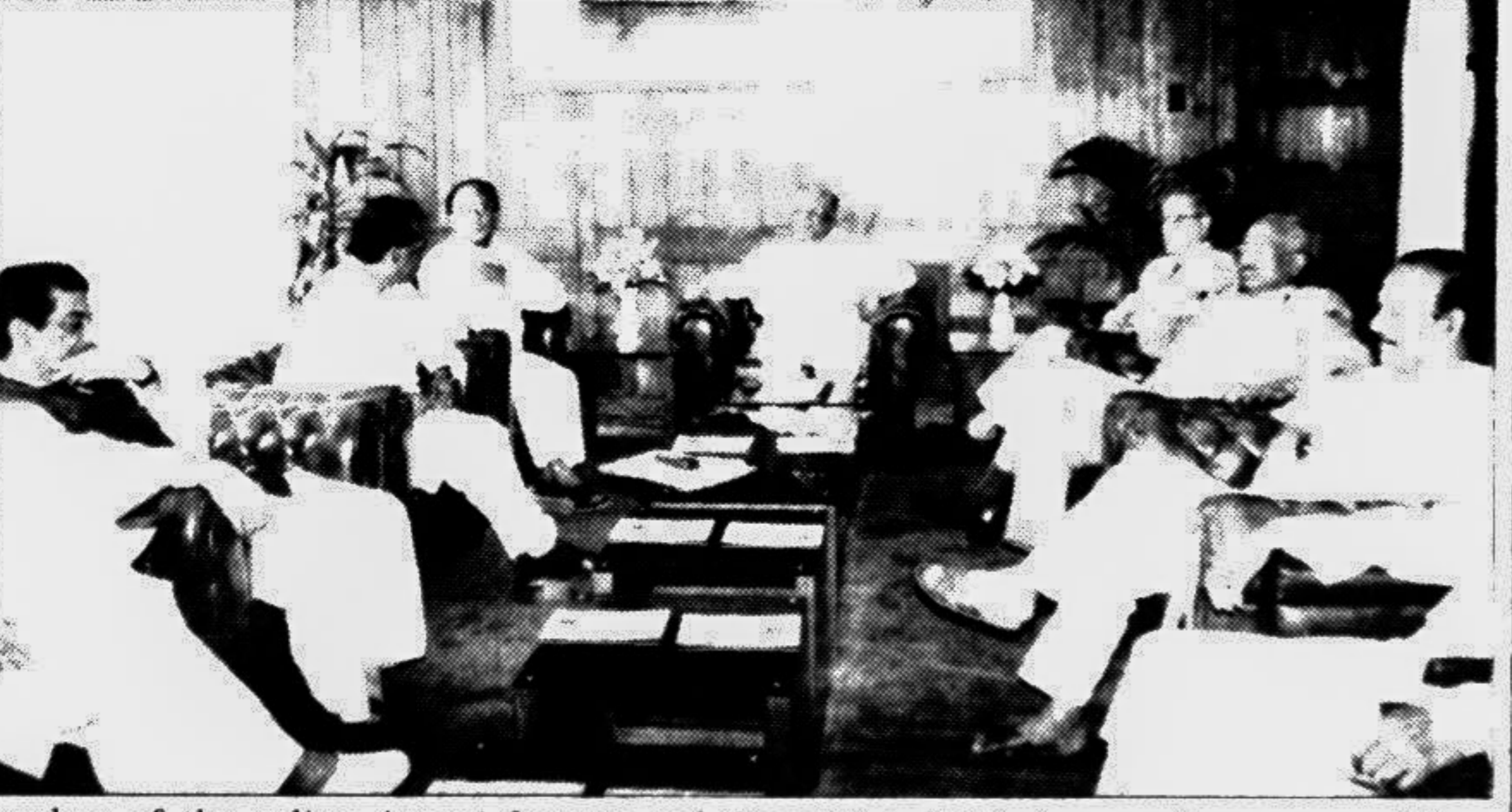
Leaders of the ruling Awami League and Opposition BNP at a meeting convened by Speaker Humayun Rashid Chowdhury at his Sangsad Bhaban chamber yesterday.