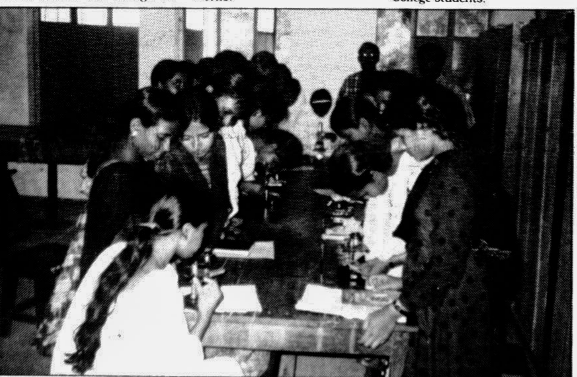
KURIGRAM: Science students doing practical class in the laboratory where there is no sufficient apparatus.