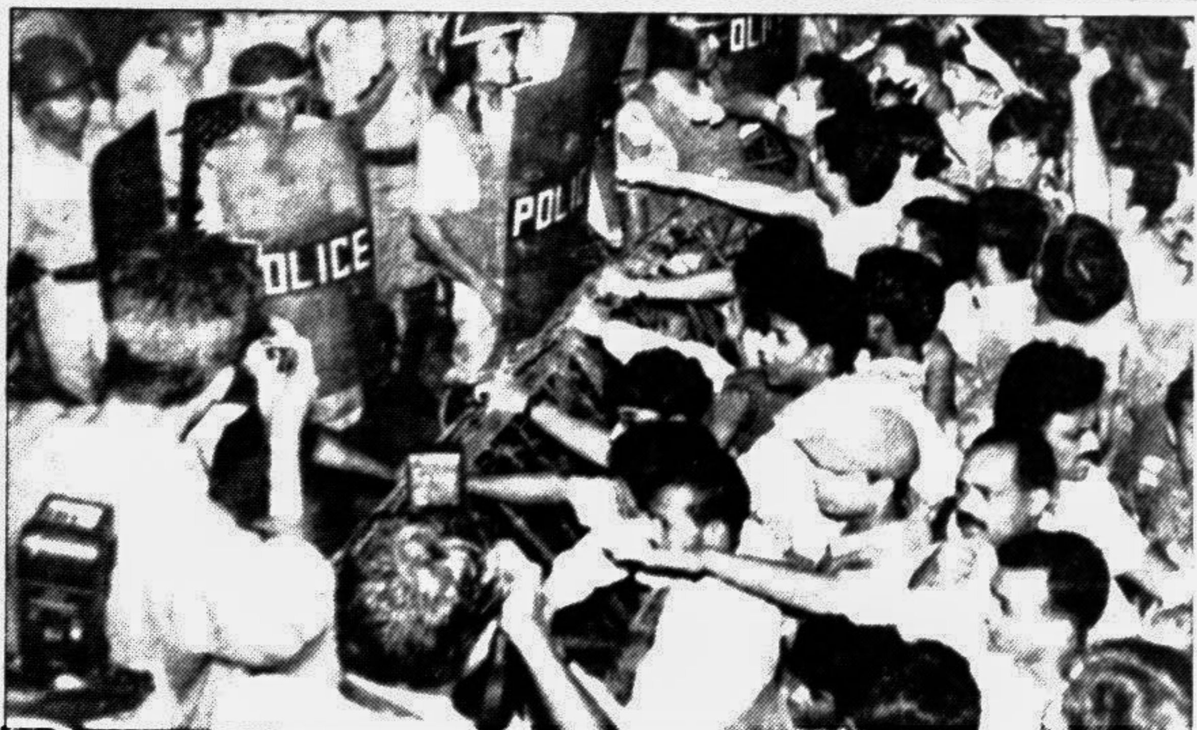
BNP's protest march towards Jatiya Sangsad was intercepted by police near Bangla Motor intersection in the city yesterday.