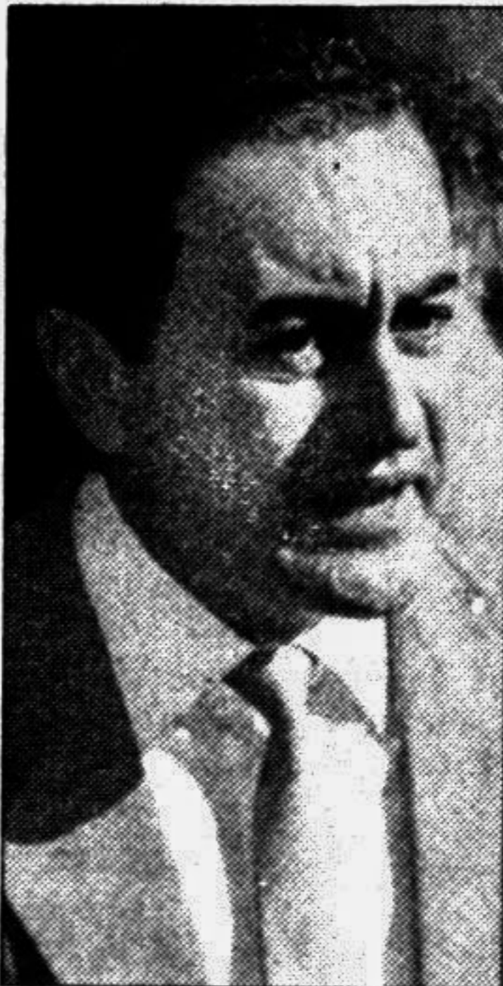
Dodi Al Fayed

Her wealthy companion, Dodi Fayed, and their chauffeur also died when their Mercedes crashed in a tunnel along the Seine River at the Pont de l'Alam bridge, just north of the Eiffel Tower.