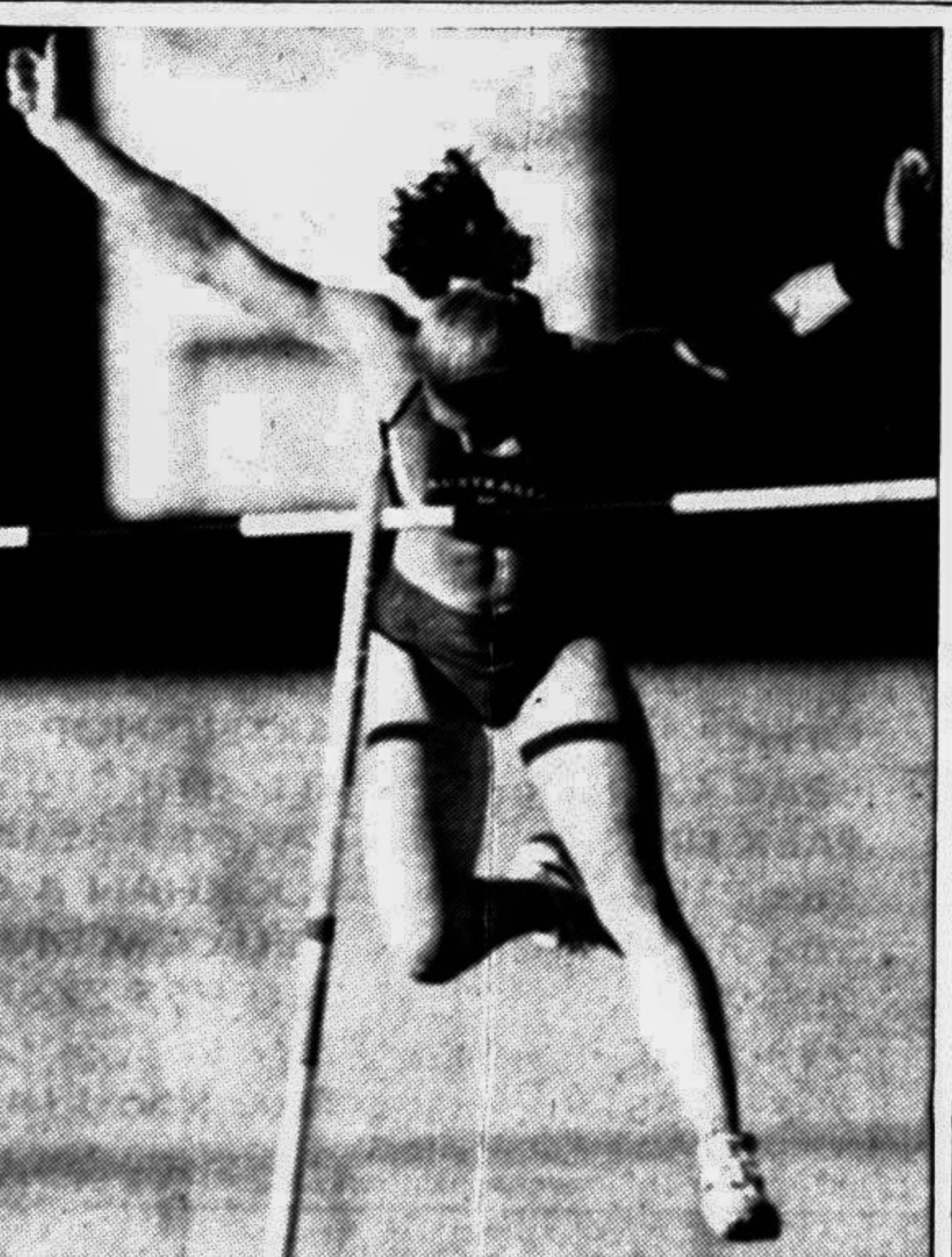
Emma George of Australia clears the bar in the women's pole vault event at the World University Games in Sicily on Aug 29. George took the gold.

CRYPTOQUIP MG LYSS RGGUL, DWREM DGLM KPOOWM KYMPWSYKL OY UYHYFU YFM GF EGHWWFR DPSSL? Yesterday's Cryptquip: THE STOLID MATHEMATICIAN ADORDED DANCING TO LOGARITHMS. Today's Cryptquip clue: H equals P The Cryptquip is a substitution cipher in which one letter stands for another. If you think that X equals O, it will equal O throughout the puzzle. Single letters, short words and words using an apostrophe give you clues to locating vowels. Solution is by trial and error.