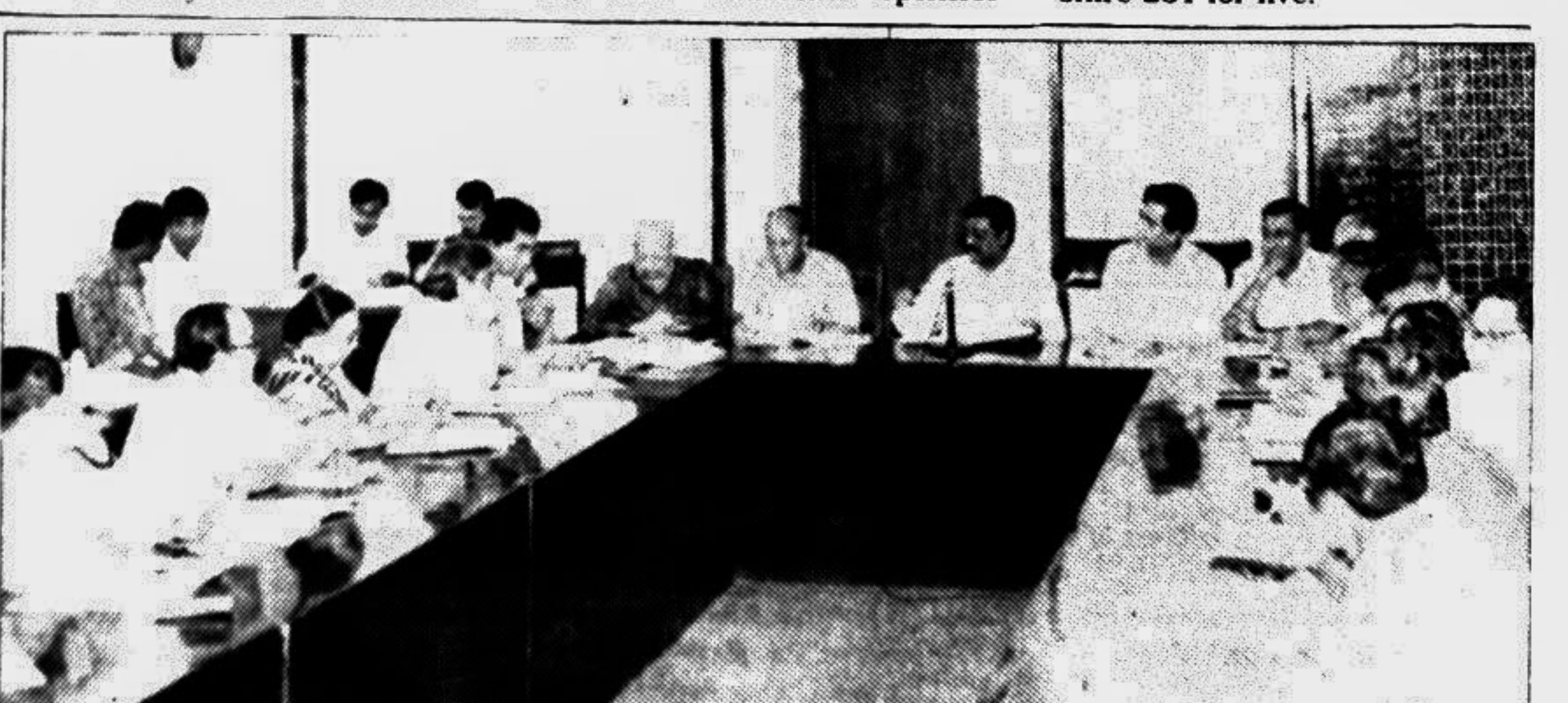
State Minister for Youth and Sports Obaidul Quader (C) presiding over a meeting of the Executive Committee of National Sports Council (ECNSC) yesterday.

Leatherdale, in company with fellow Yorkshireman Steve Rhodes (59 not out), had put on 111 in an unbroken sixth-wicket partnership when the close came with Worcester-shire 251 for five.