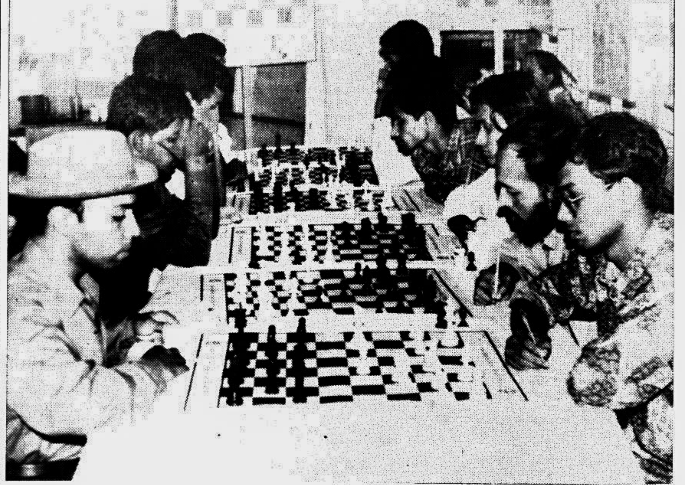
Scene from the Second Division chess league after the fourth round yesterday at the NSC.

Pakistan toured India for their first Test series in 1952 but tours were stopped after three series for a 17-year period that ended in 1978.