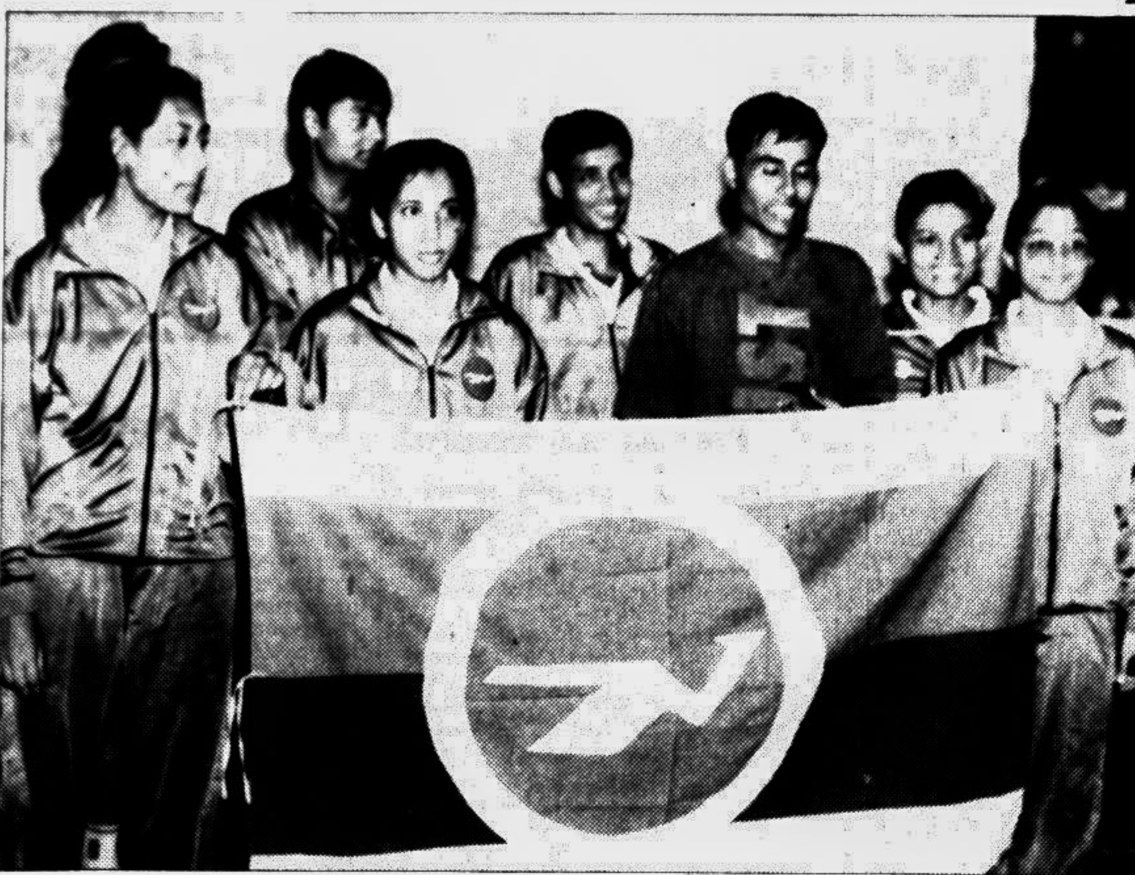
Members of the Bangladesh Biman team, who swept all the titles in the Rupali Insurance summer badminton tournament yesterday, pose in front of their banner at the wooden floor gymnasium.

The procession, which included marching bands and drum majorities, was a show of support for the official bid team which plans to depart Sunday for Lausanne, Switzerland.