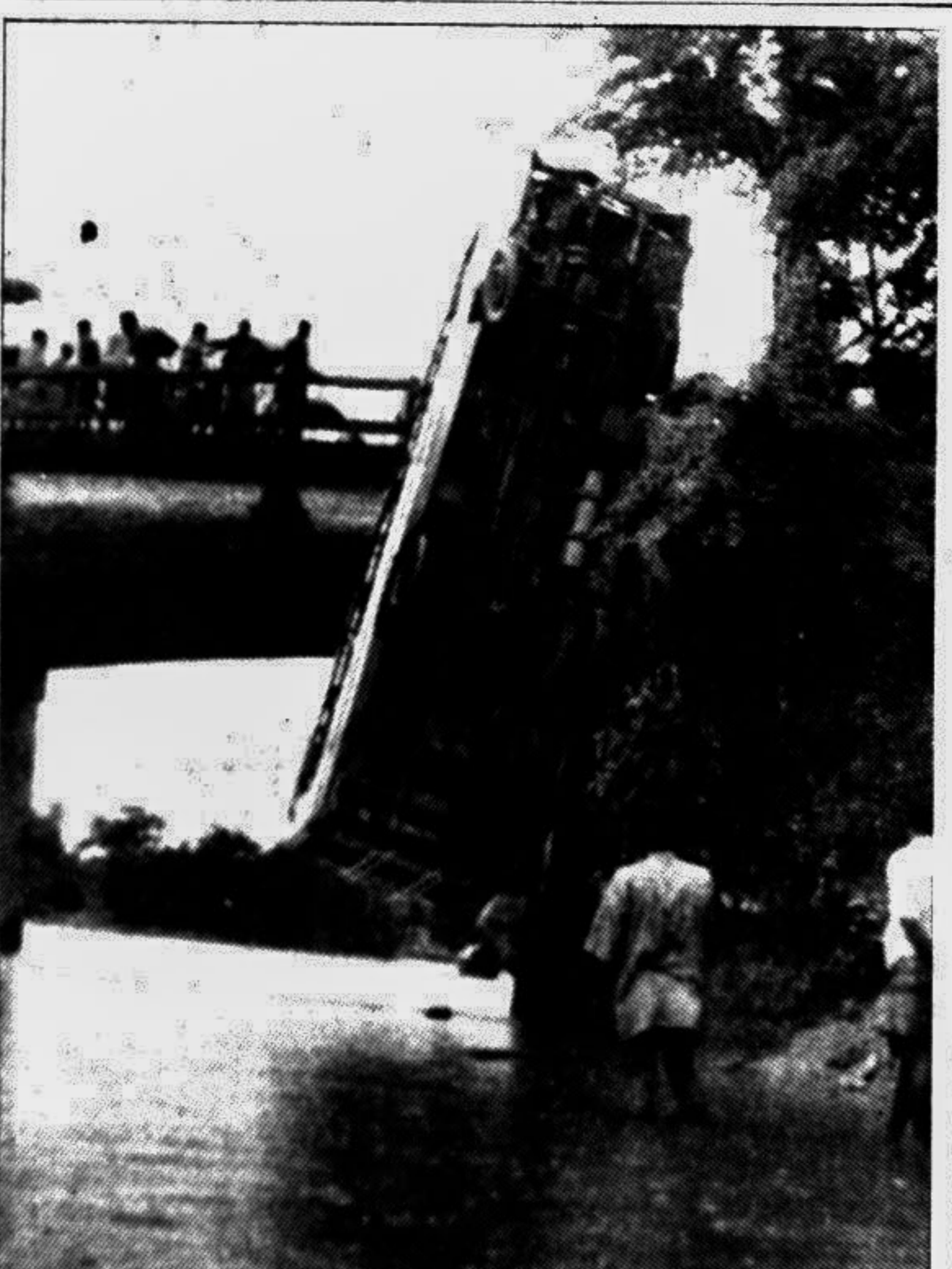
The minibus which plunged into the Ichhamati river near Manikganj was salvaged yesterday. Fourteen passengers were killed in the accident on Friday. No other body was found inside the bus.

The inaugural session was followed by a cultural function.