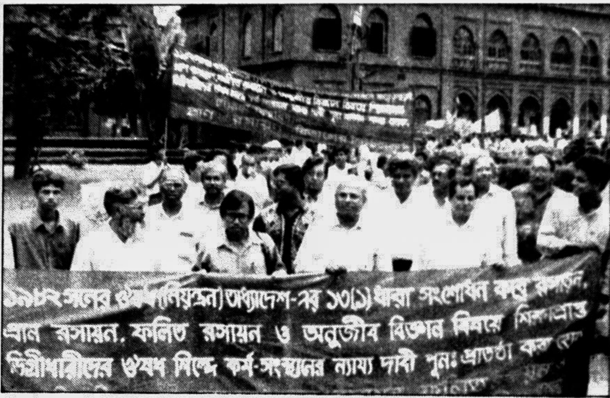
Teachers and students of biological science departments of Dhaka University brought out a silent procession on the campus yesterday to press their various demands.