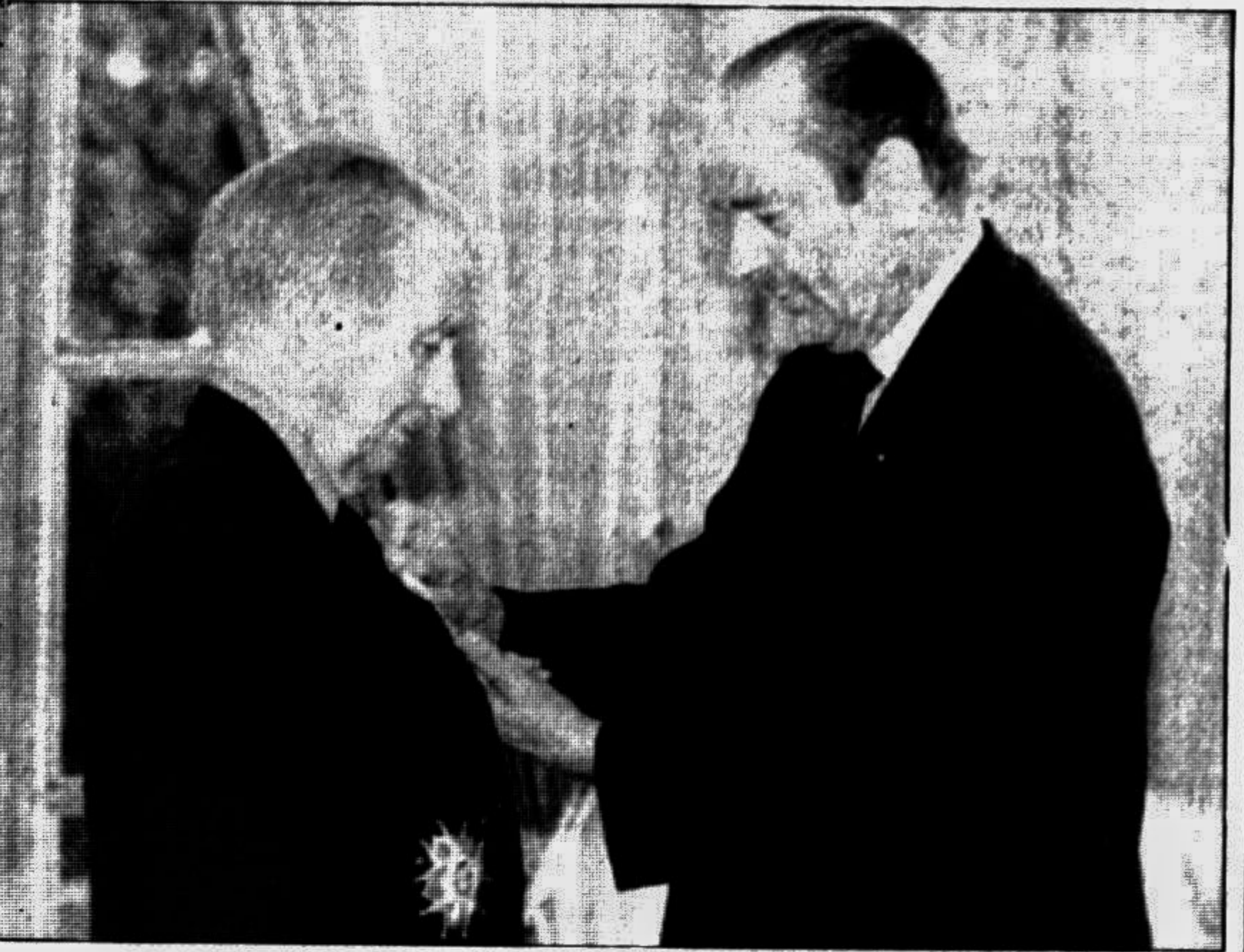
French President Jacques Chirac (R) decorates International Olympic Committee chief Juan Antonio Samaranch with Legion D'Honneur at the Elysee Palace in Paris on Aug 28.