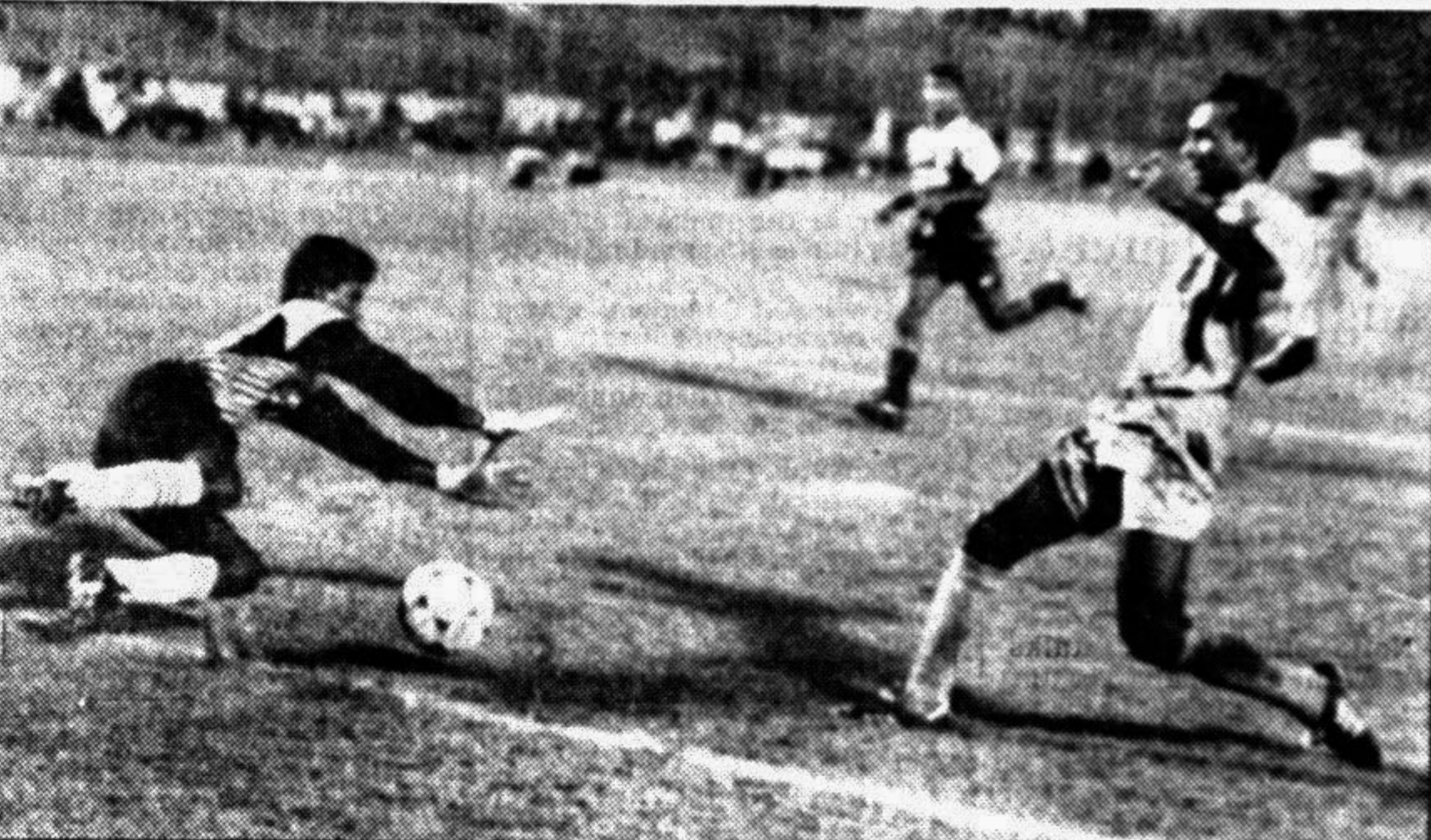
Action from Asian Cup Winners' Cup first round second-leg match between Abahani and Old Benedictines Club of Sri Lanka at the Mirpur Stadium yesterday.

Two Group B fixtures are billed for the day. The tournament enjoyed a three-day recess because of the Asian Cup Winners' Cup double-leg tie between Abahani and Old Benedictines of Sri Lanka.