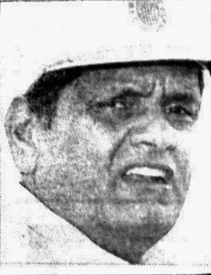
Ramanathan Krishnan (Former Indian tennis player) "If you fight to win a tennis match, you know how to face the problems of life."

COMPETITION FOR SCHOOL CHILDREN Competition-77