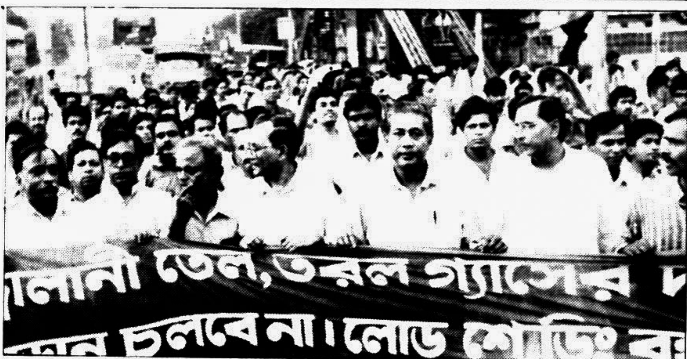
Left Democratic Front (LDF) brought out a procession protesting the price-hike of petroleum products in the city yesterday.

The LDF leaders criticised the government for raising the price of fuel bypassing the parliament. It has become a tradition for our governments to take important decisions sidetracking the parliament, they said.