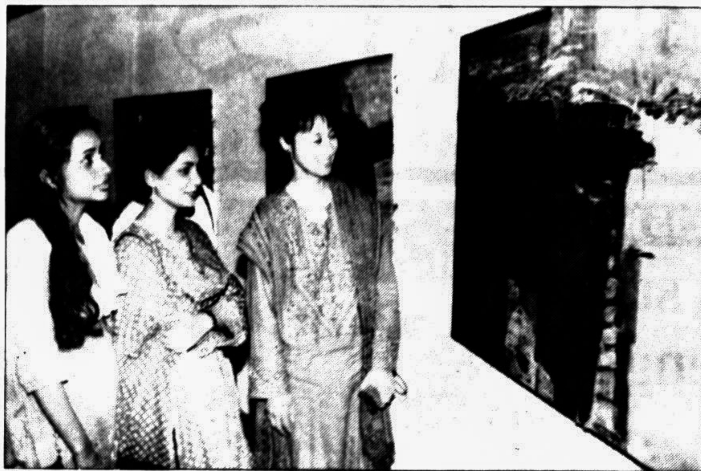
Visitors at an exhibition of paintings by Japanese artist Sanae Watanabe, which began at the Zainul Gallery, Institute of Fine Arts, DU, yesterday.