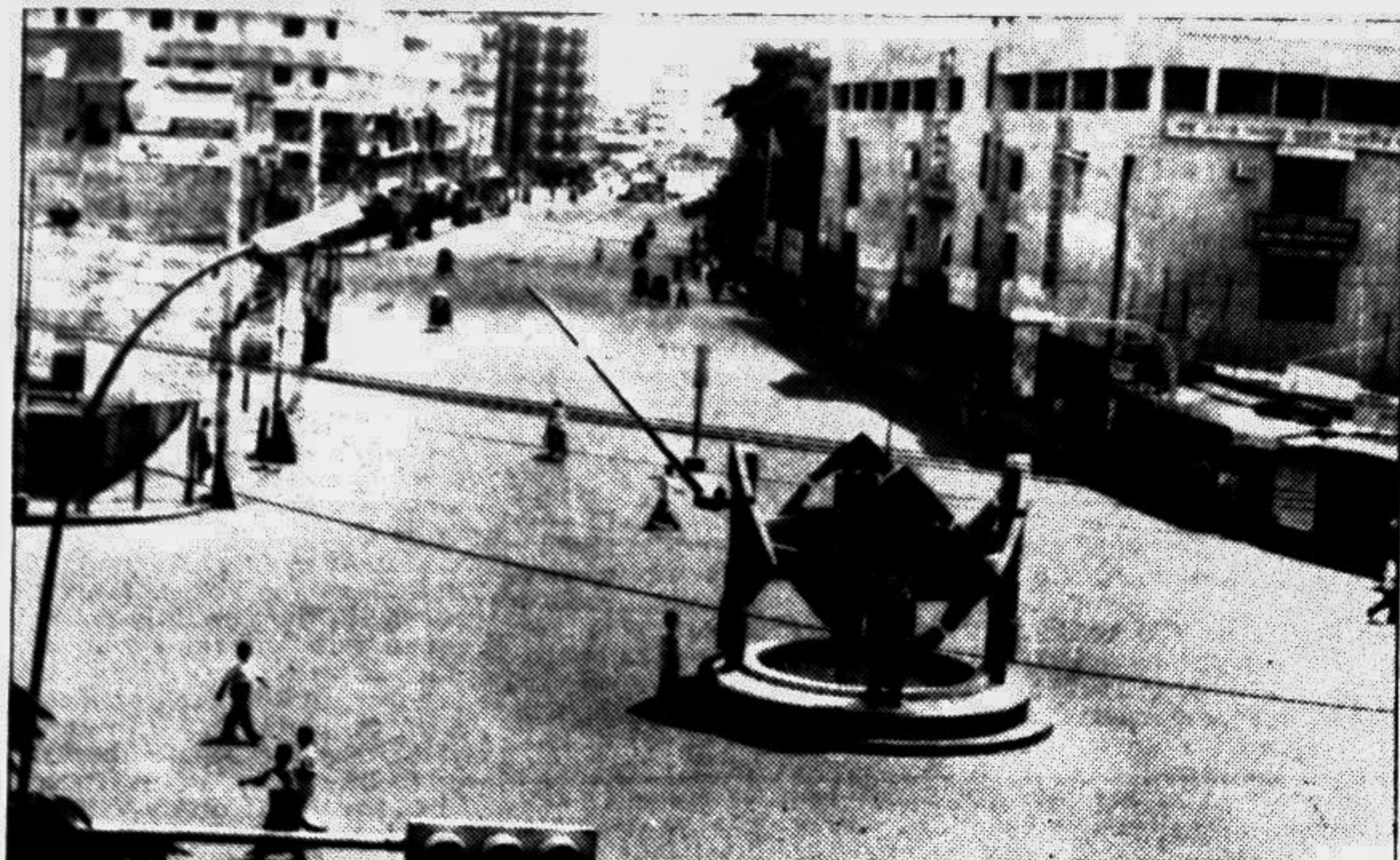
Gulistan area during yesterday's hartal, called by BNP protesting the recent price-hike of fuel.