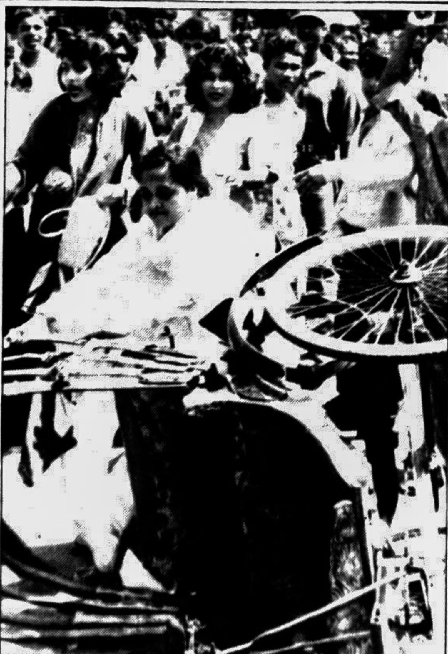
BNP women activists damaging a rickshaw during hartal hours in city's Topkhana Road yesterday.

WHY WASTE YOUR MONEY for foreign or multinational paint