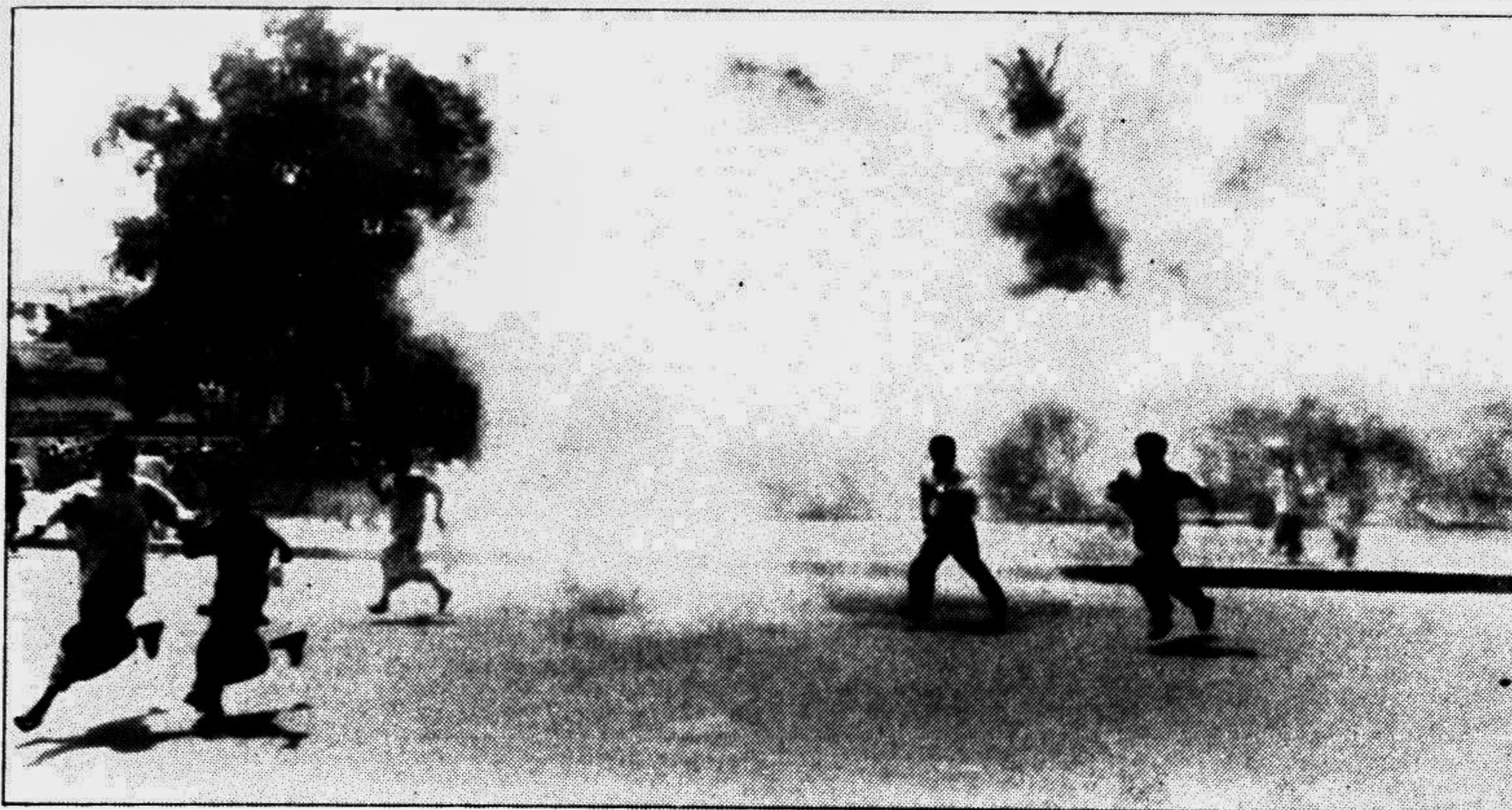
Police lobbed tear gas shells to disperse pickets at Topkhana Road in the city during hartal hours yesterday.

BJMC bid to bail out farmers Foodgrain production in India likely to cross a record 200m MT mark this year Pages 6, 7