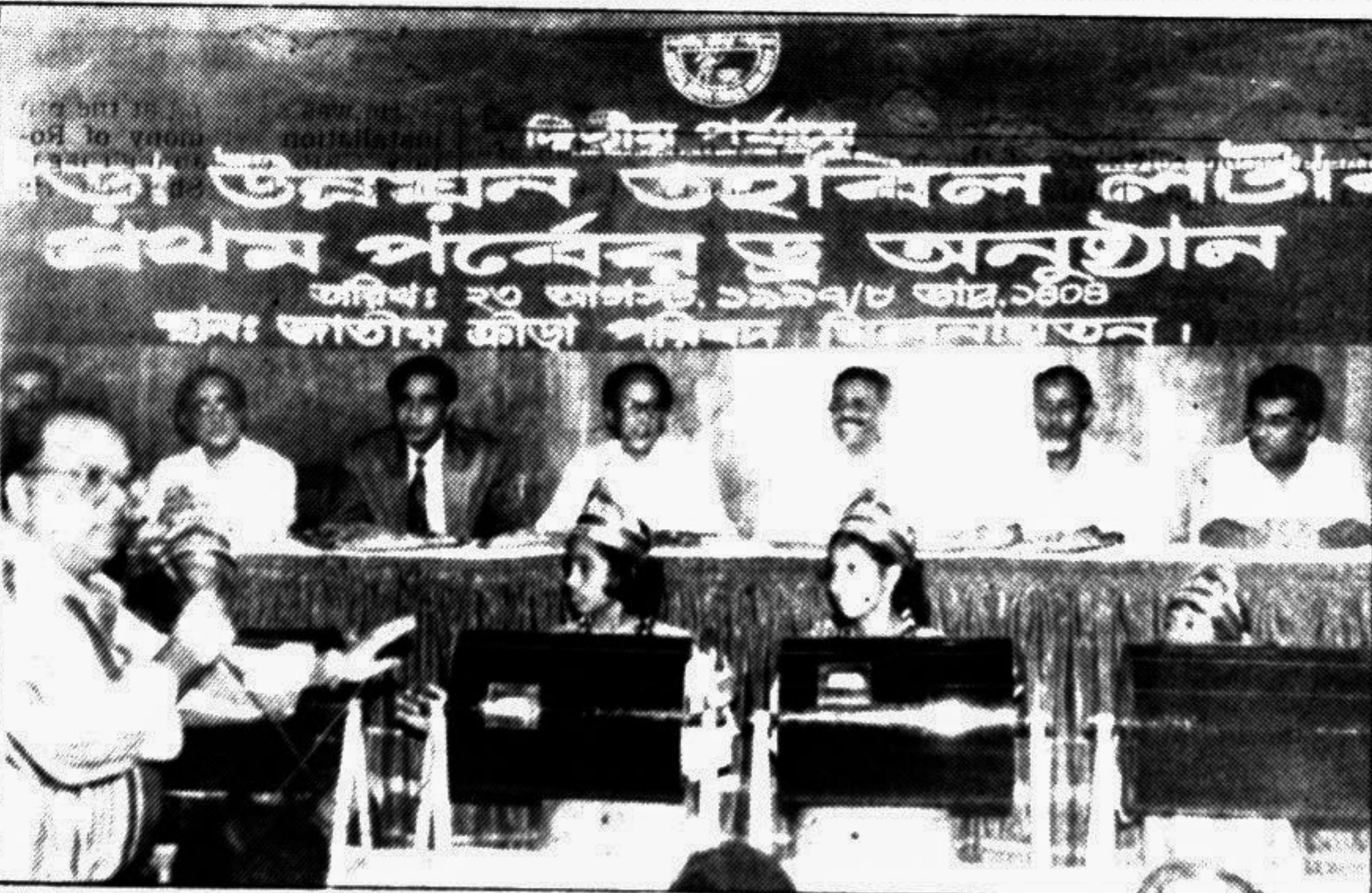
The draw for the national lottery, organised by National Sports Council, was held in the city yesterday.

Only two per cent of the total tax collected by the DCC goes to conservancy, therefore each city-dweller pays about Tk 20 per year for the purpose," he added.