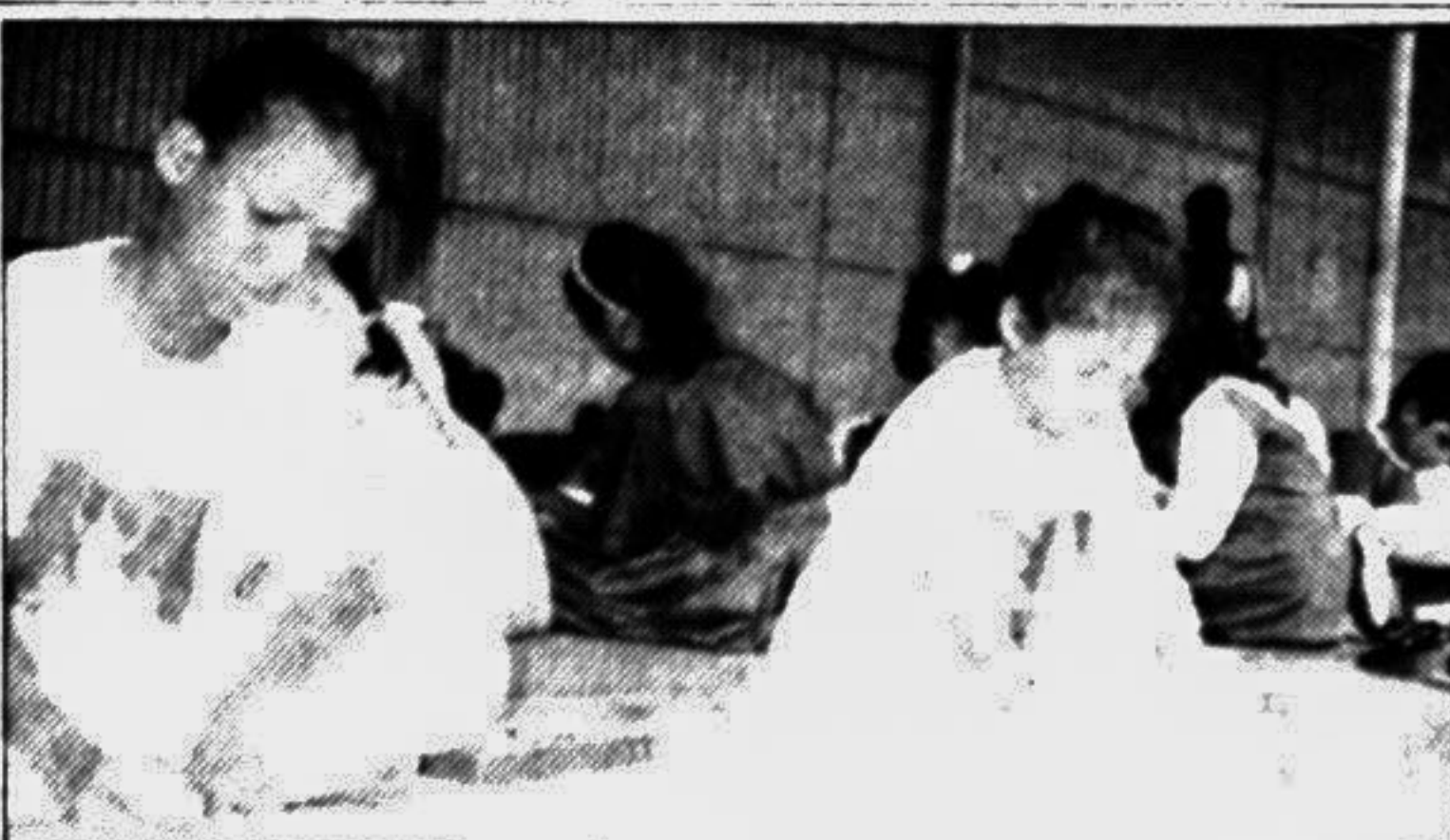
A children's painting competition was organised by Mahanagar Sarbajanin Puja Committee on the occasion of Janmashtami at the Dhakeshwari Mandir premises in the city yesterday.

Rotary Club of Sonargaon Dhaka: The weekly meeting will be held. Venue: Purbani Hotel. Time: 5:30 pm.