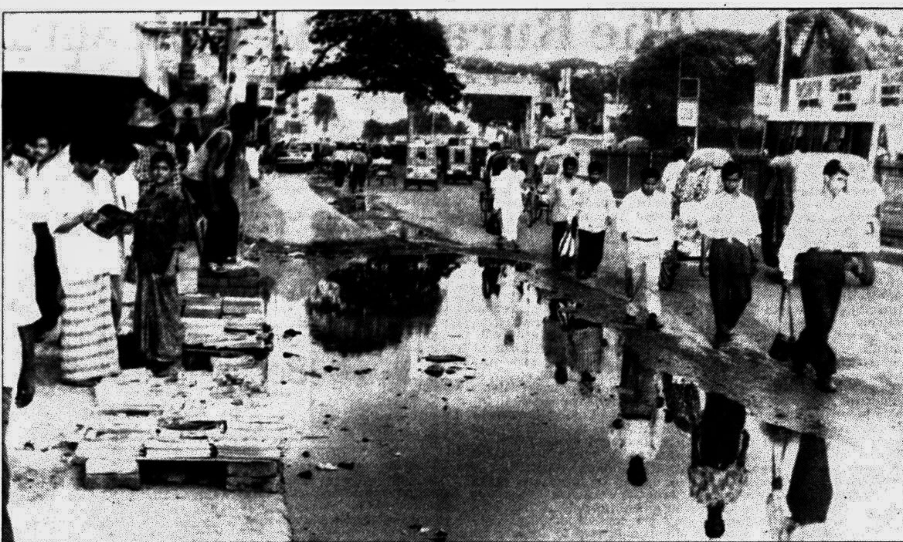
Miserable state of city roads: The problem is worse at Paltan. Construction materials and water-logging force pedestrians to walk on the main road in front of the Workers Party office. The footpath is half taken over by the hawkers.