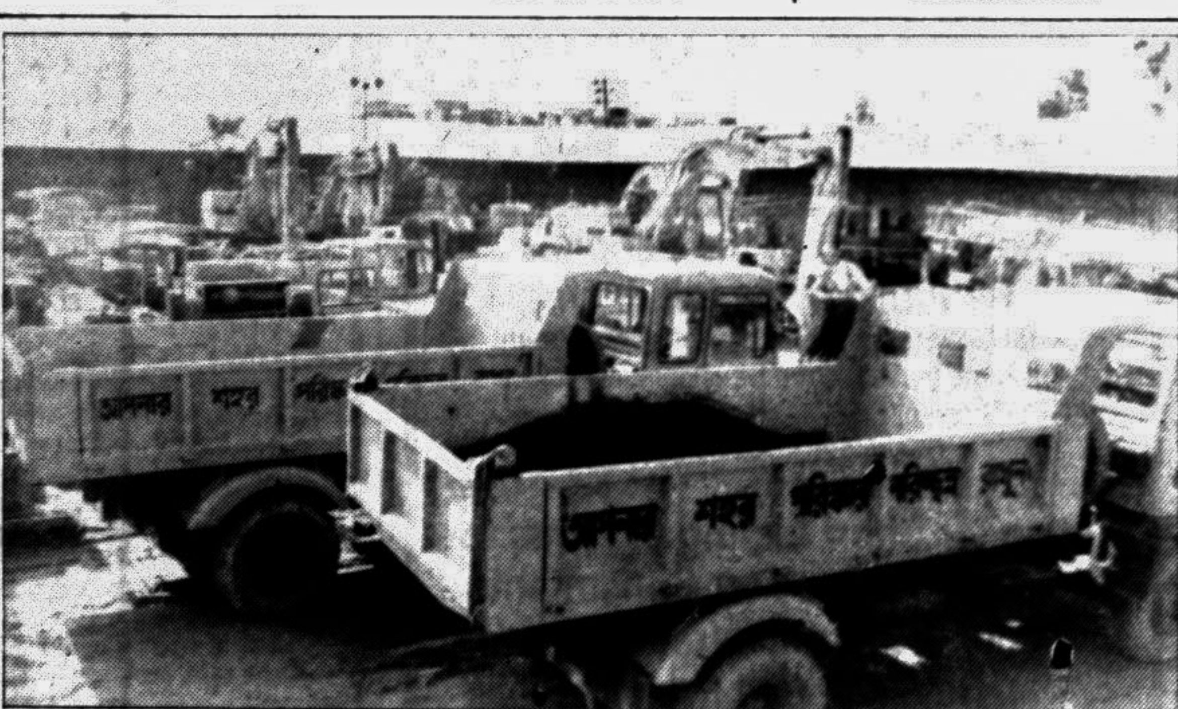
Garbage carrying vehicles of the DCC awaiting repair at its Dhalpur workshop.