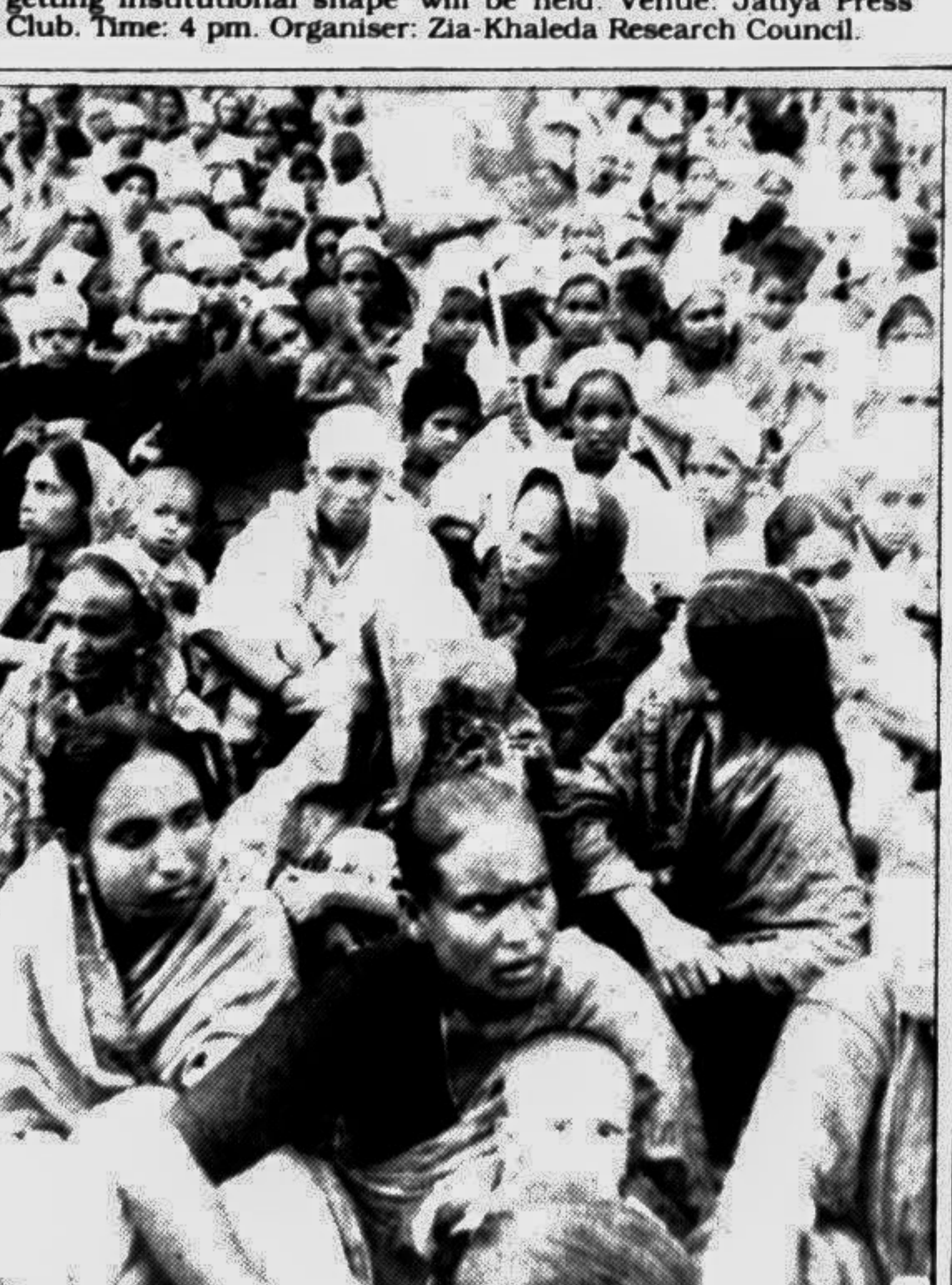
The Association of Development Agencies in Bangladesh (ADAB) organised a rally, protesting repression and abuse of women, in front of the National Museum yesterday.

Discussion: A discussion on 'Why democracy is not getting institutional shape' will be held. Venue: Jatiya Press Club. Time: 4 pm. Organiser: Zia-Khaleda Research Council.