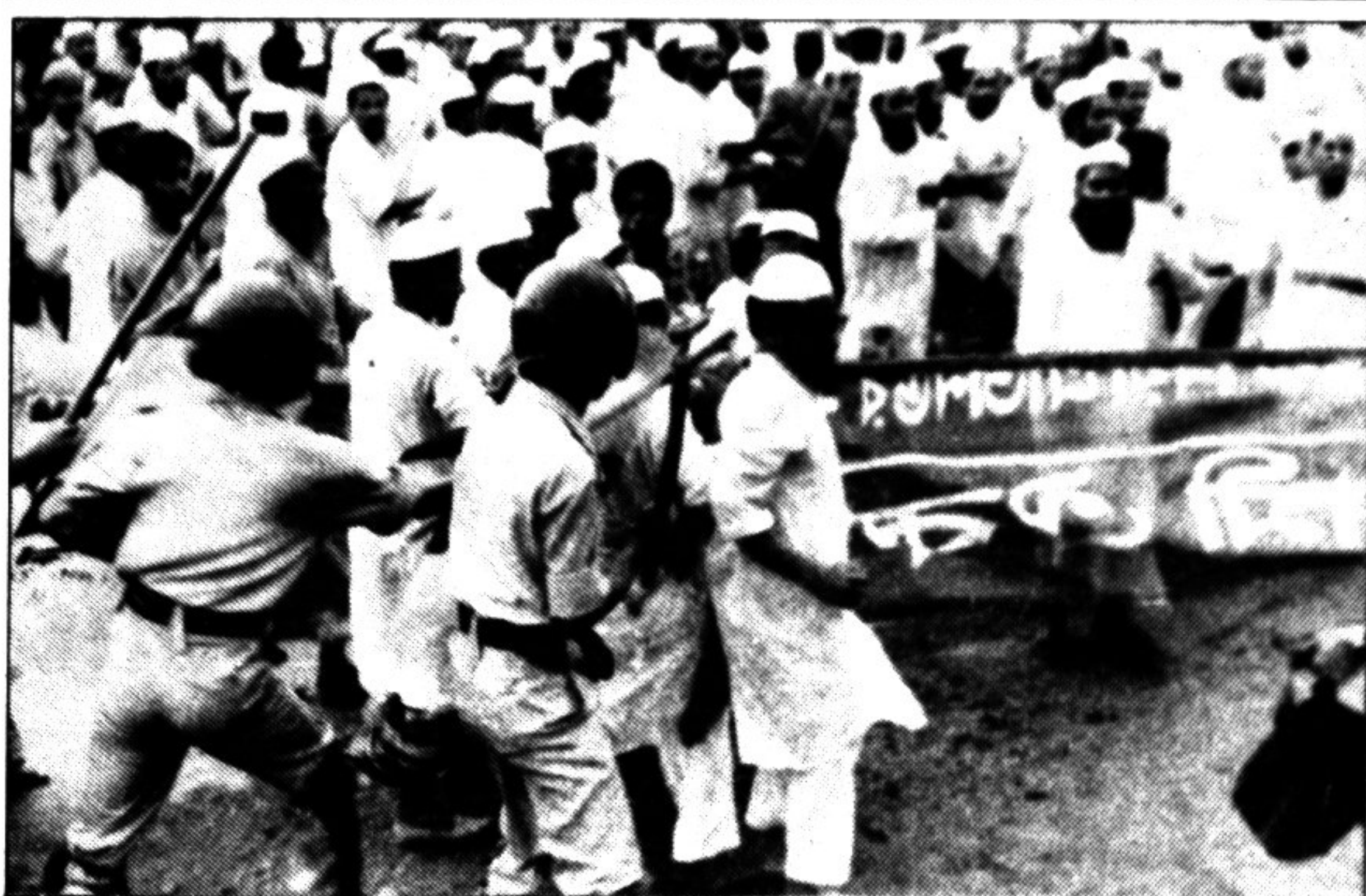
Police dispersing activists of Islami Oikya Jote in Baitul Mukarram area for defying a ban on rallies and procession there yesterday.