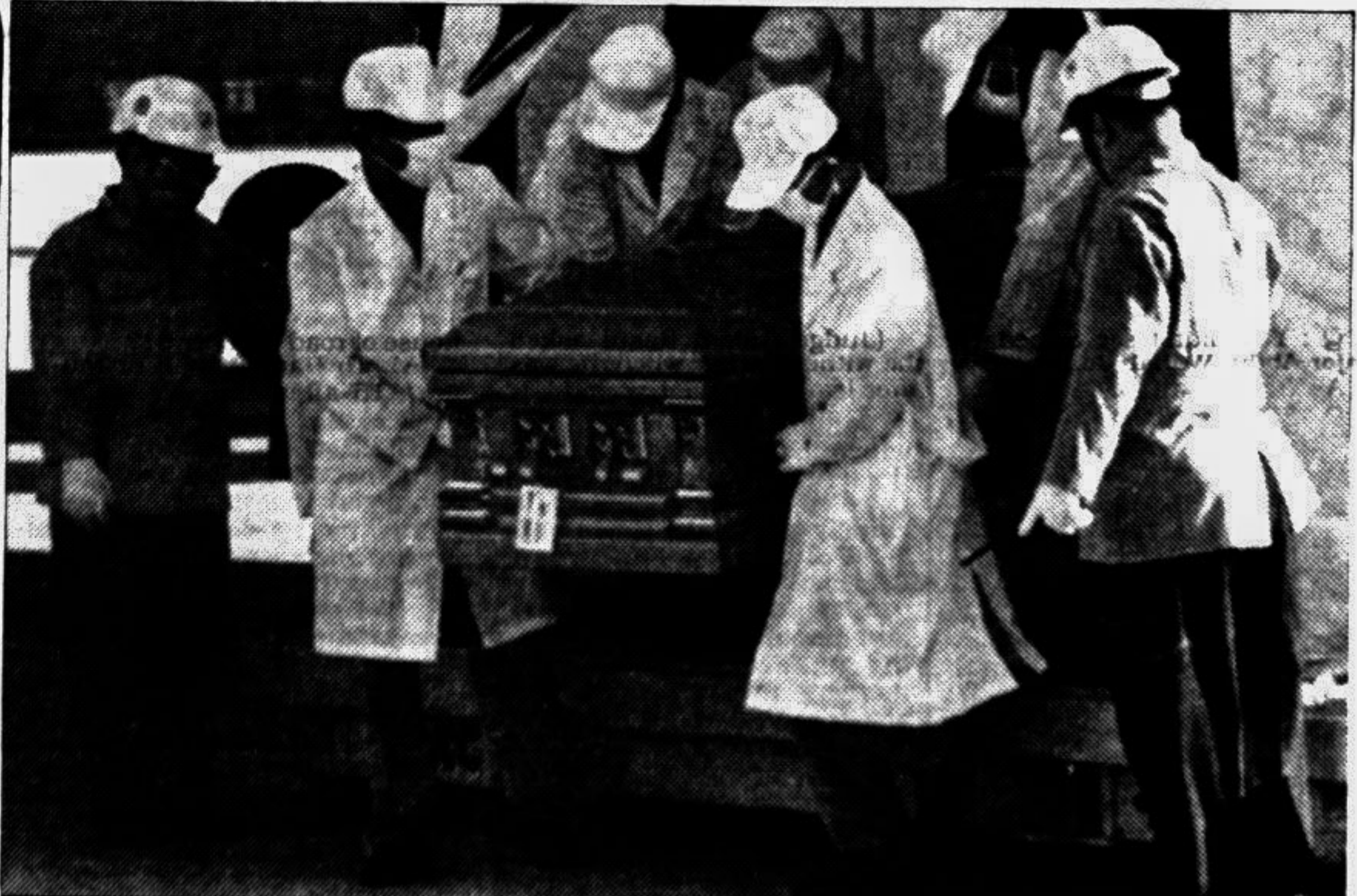
Masked South Korean workers unload a coffin containing the remains of one of the victims of the Korean Air Flight 801 that crashed in Guam on August 5 from a Korean Air plane at Kimpo International Airport in Seoul Wednesday...