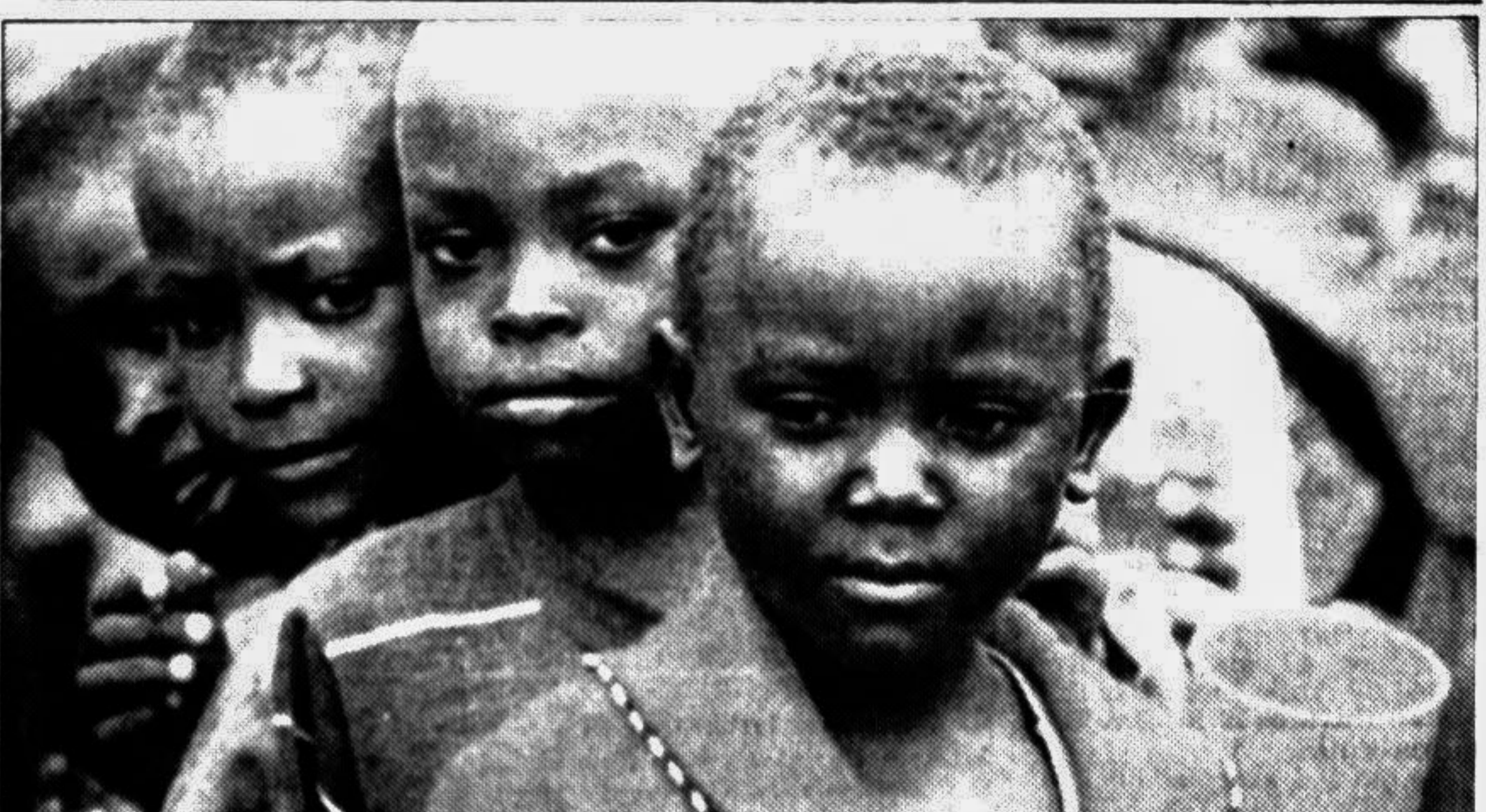
Files: Abandoned Hutu refugee children wait for food given by the UNHCR in Mbandaka, Congo, northeast of Kinshasa, June 24, 1997. Many children were separated from their families or abandoned as Rwandan refugees fled the recent civil war in Zaire, now renamed Congo.