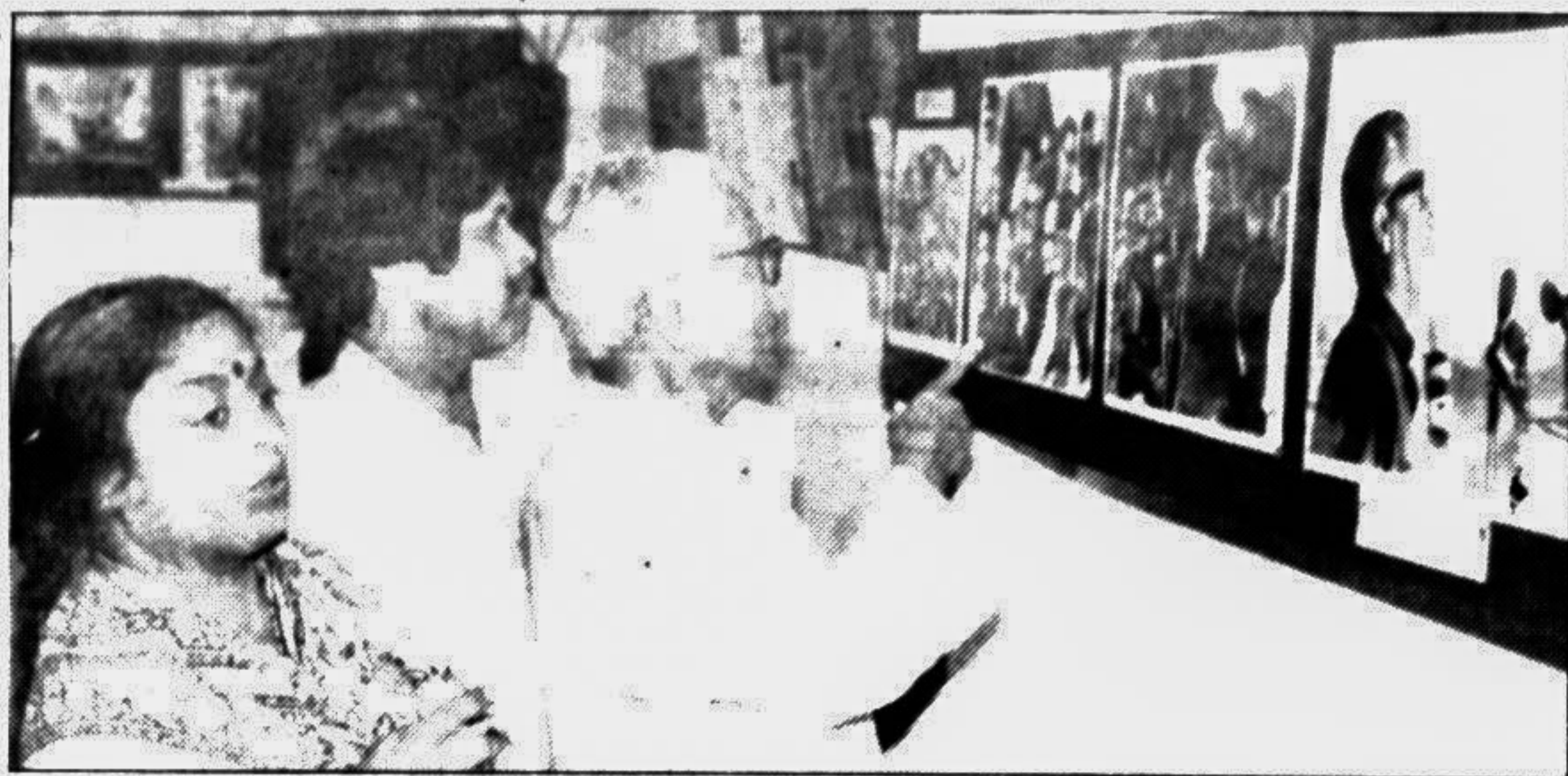
Visitors at a photo exhibition organised in observance of National Mourning Day at the Mukhtijuddha Jadughar in Segun Bagicha yesterday.

*O/A *BBA *MBA *CIMA *BUET passed. Talented tutors are available for all classes.