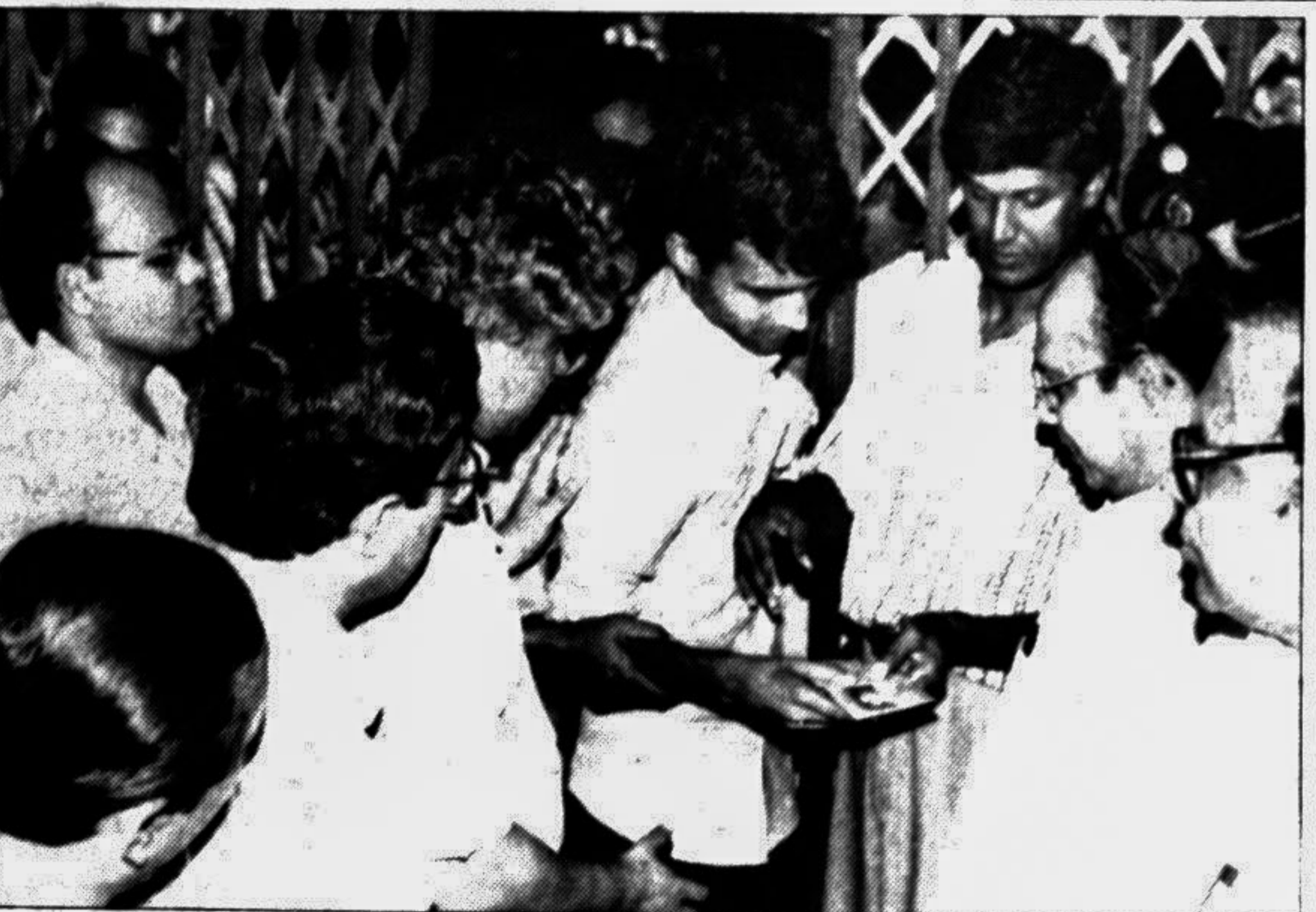
Identity cards of students being checked in presence of VC Prof AK Azad Chowdhury at Ziaur Rahman Hall of Dhaka University yesterday before allowing them to enter the dormitory.