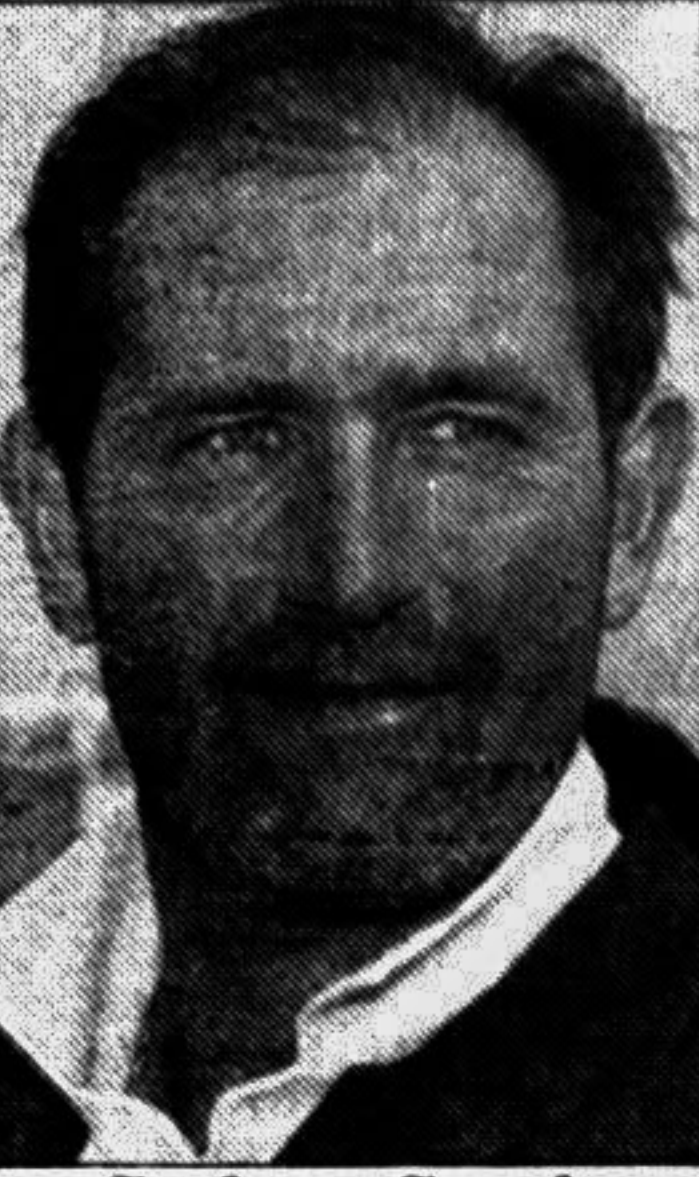
Graham Gooch (Former England cricket captain) The old petrol warning light has been flashing for five years, and now I know that the tank is empty.

While announcing his retirement from the game.