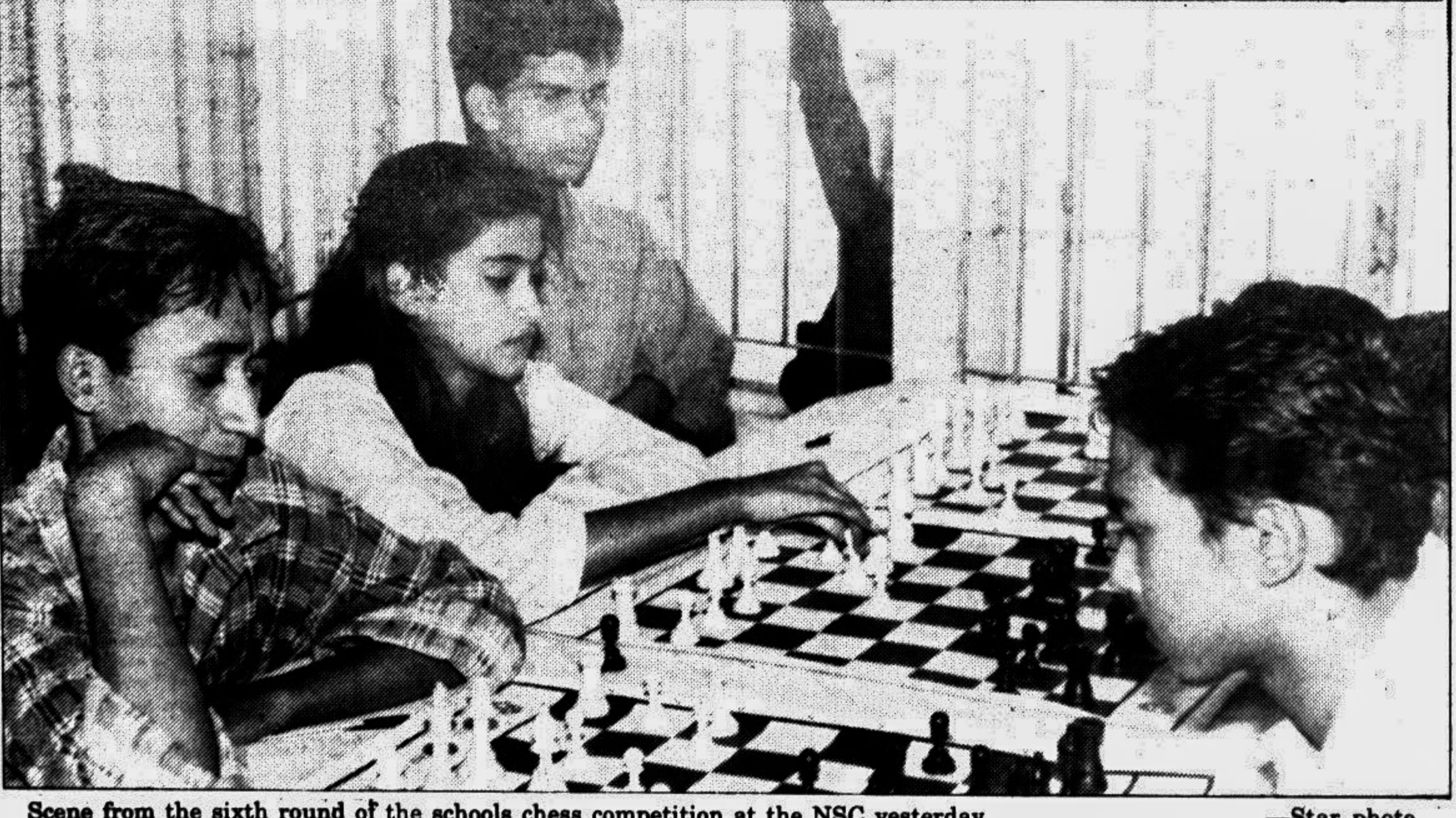
Scene from the sixth round of the schools chess competition at the NSC yesterday.