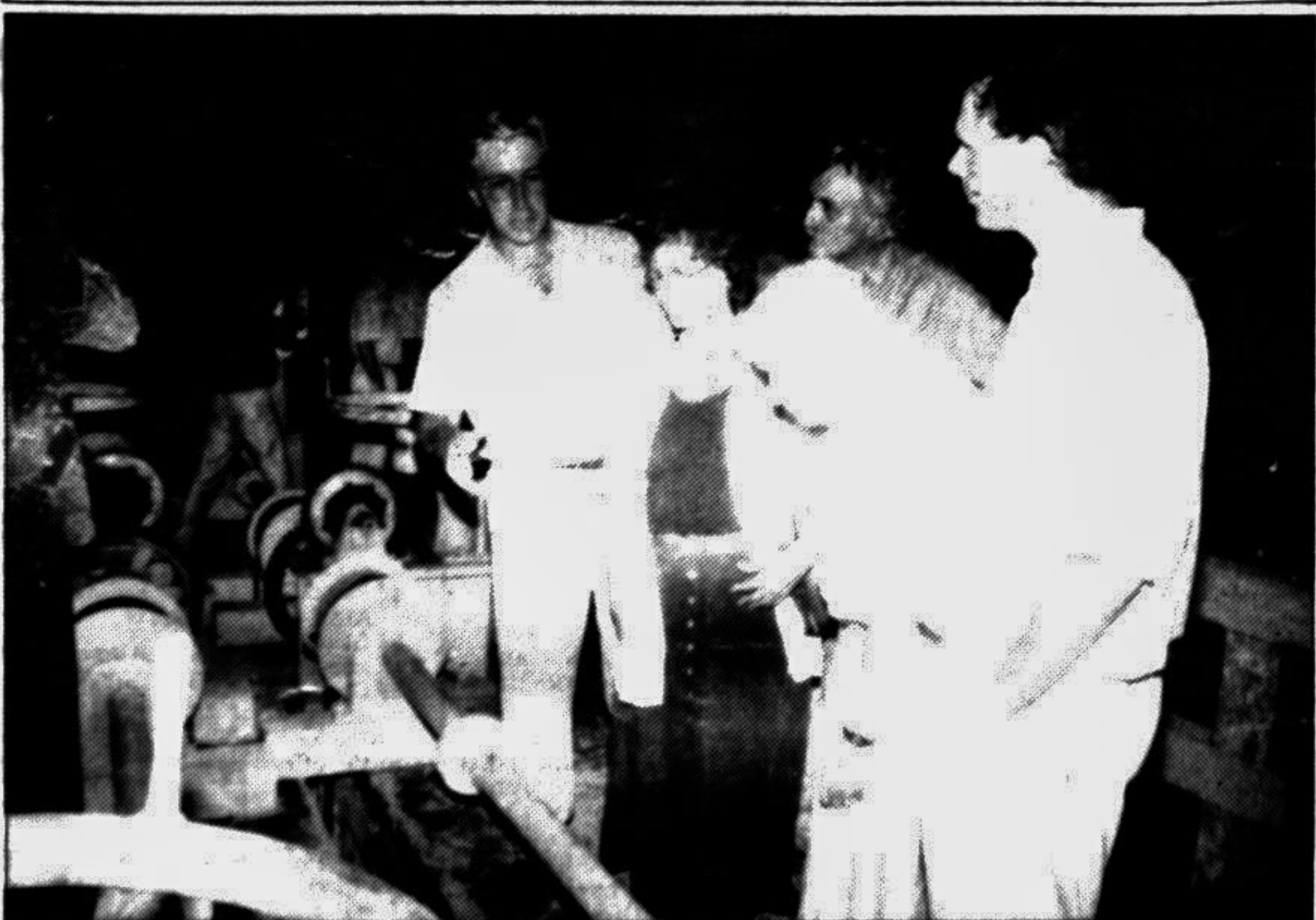
TANGAIL: Jan Pronk, Development Assistance Minister of the Netherlands recently visited the Main Inlet Regulator of Compartmentalisation Pilot Project at Jugni