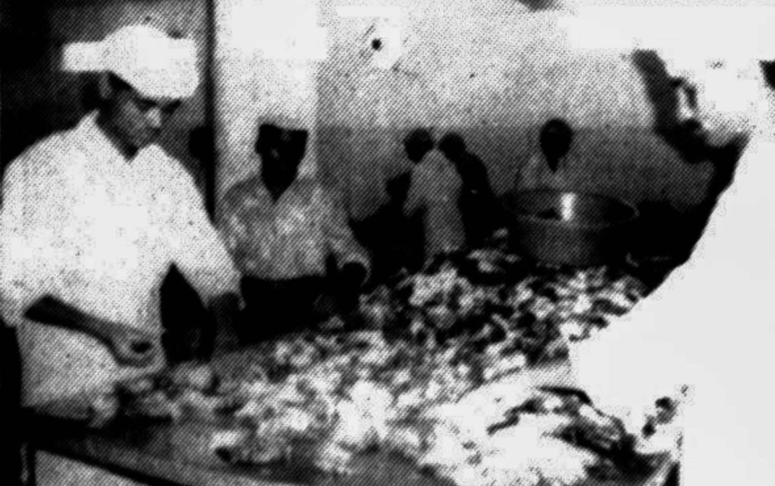
DESTINATION UNKNOWN: Black tiger shrimps are being graded and packed in Khulna plants but exporters do not know where to sell them.

Bangladesh's frozen food processing plants were quite able to maintain EC and US regulations. "Out of 12 plants I visited, some were good, some very good and some excellent" a German government official, who visited the processing plants recently, was quoted to have told the EPB official. Meanwhile, the government has taken steps to raise the 'efficiency level' of the relevant authorities, the Department of Fisheries in this case, responsible for quality control of the exporting plants. "We will soon buy new equipment to enrich our testing laboratories," All said. The Fisheries Department also plans to recruit additional manpower to monitor the quality performances of the plants. The EPB and fishery officials hoped EC would lift its ban after the coming review because they believe Bangladeshi processing plants could really overcome their current shortcomings.