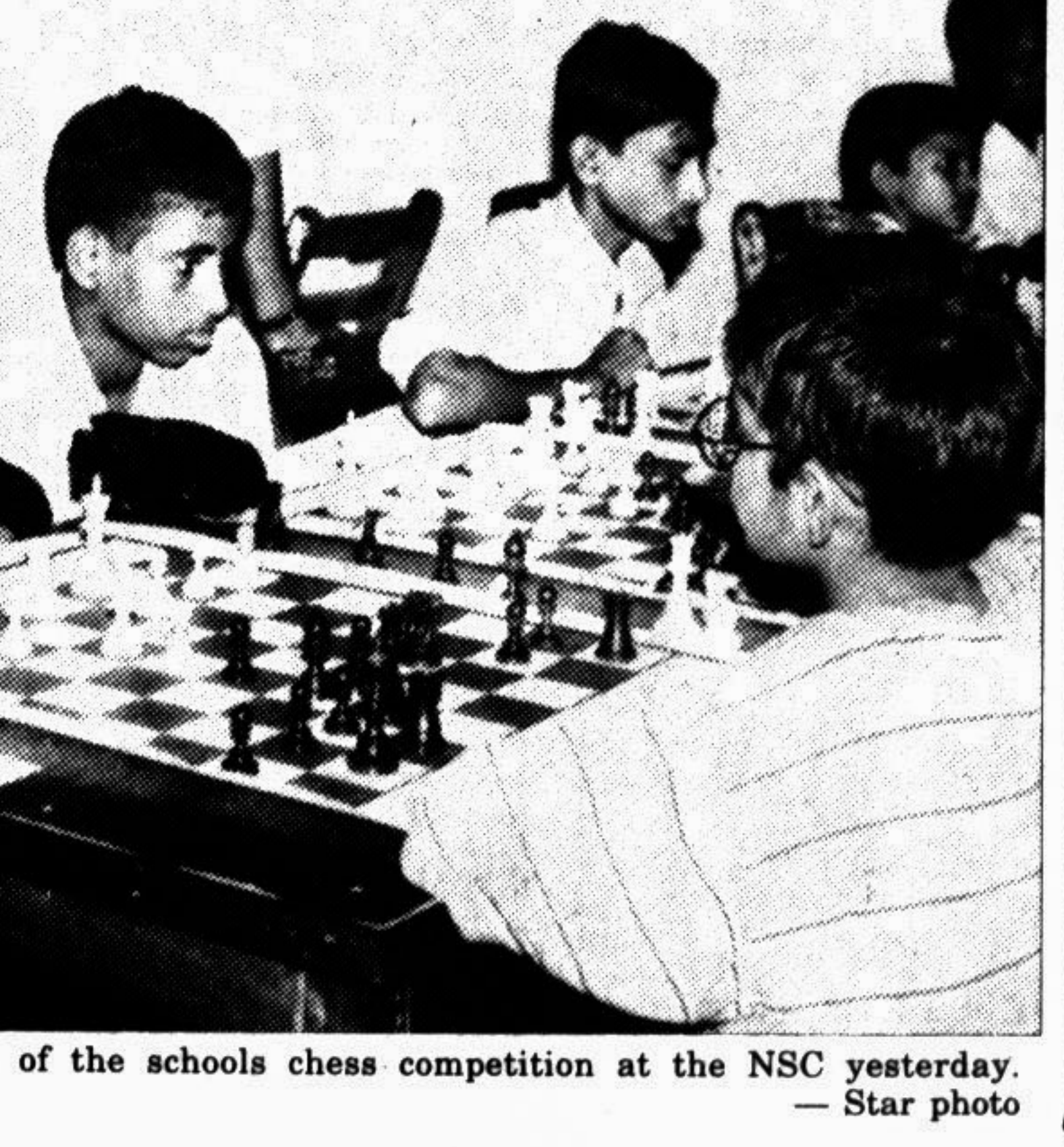
Scene from the fifth round of the schools chess competition at the NSC yesterday.