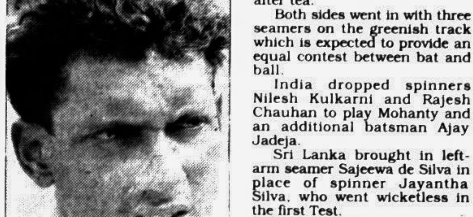
DE SILVA ... 144 n.o

to put Sri Lanka in under over-cast conditions paid off despite a rollicking start by Jayasuriya and Marvan Atapattu, who hammered 53 runs in the first hour.