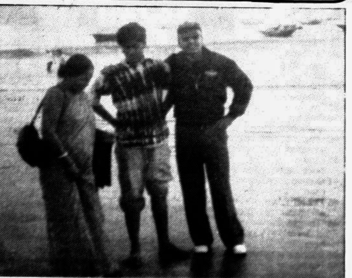
BARISAL: Morning scene at Kuakata sea beach.

The districts are: Barisal, Jhalakati, Bhola, Pirojpur, Patuakhali, Barguna, Faridpur, Madaripur, Shariatpur, Rajbari and Gopalganj.