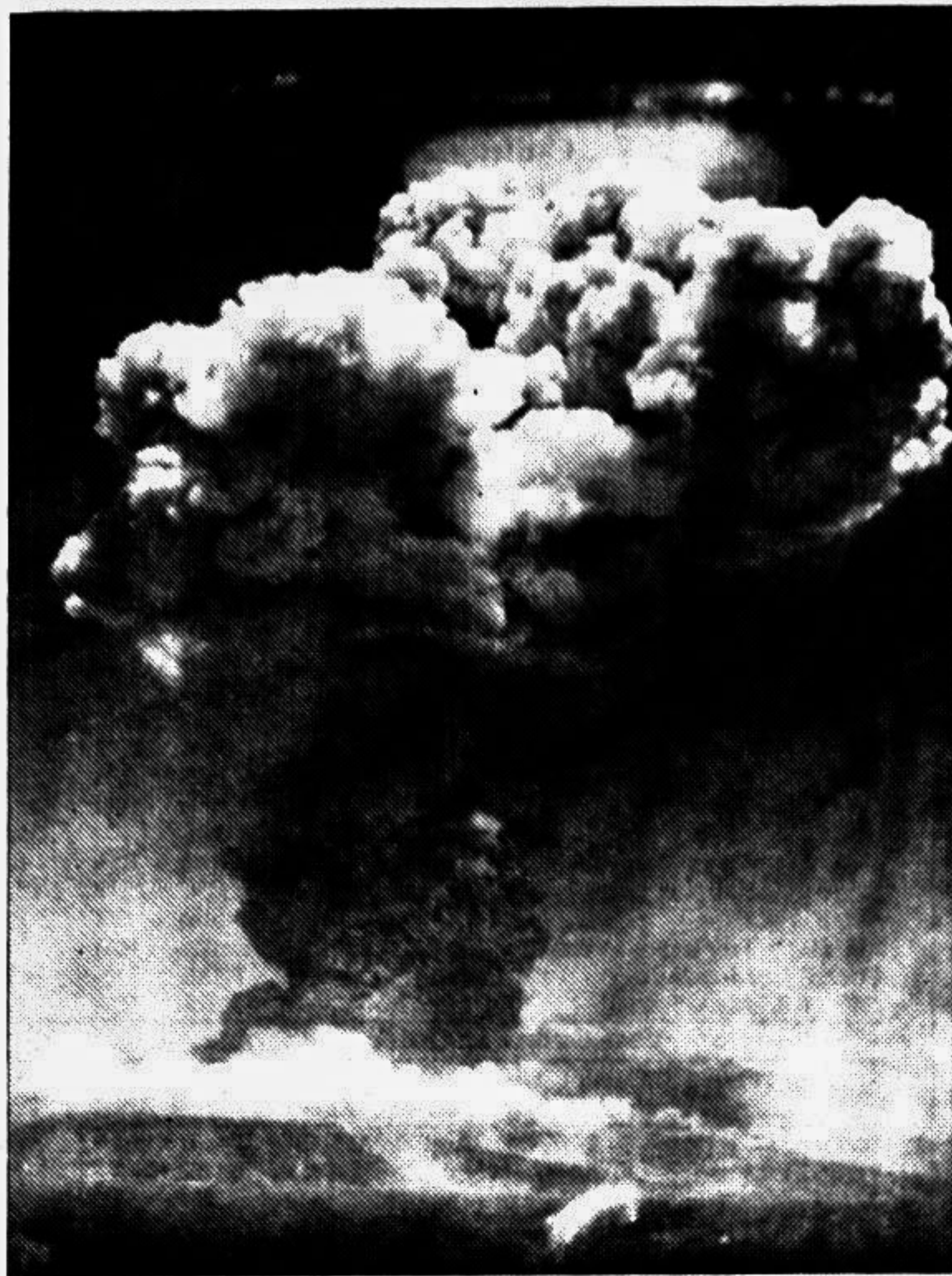
A massive column of smoke billows over the Soufriere Hills volcano as it erupted again Friday. Guadeloupe and other islands have been working on a plan for the possible evacuation of the 5,000 people who remain on the British Caribbean colony.

Dennis Ross's arrival on Saturday to try to break a crisis in Israel-Palestinian peacemaking. Israeli planes unleashed rockets south of Beirut on Friday just hours after Katyusha rockets fired from Lebanon slammed into northern Israel.