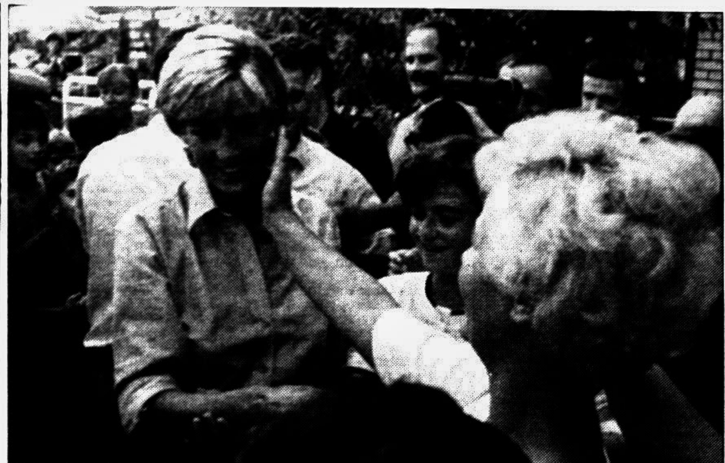
An unidentified Bosnian woman amongst children touches the cheek of Princess Diana, in Tuzla Friday. Princess Diana arrived her for a three-day visit to Bosnia as part of her global campaign against landmines.

those of North Korea and those released last month by the aid agency, Caritas. "It is very important that the immediate significant humanitarian crisis not find itself hostage to what is also a political crisis. Humanitarian needs can't wait," she told a news conference.