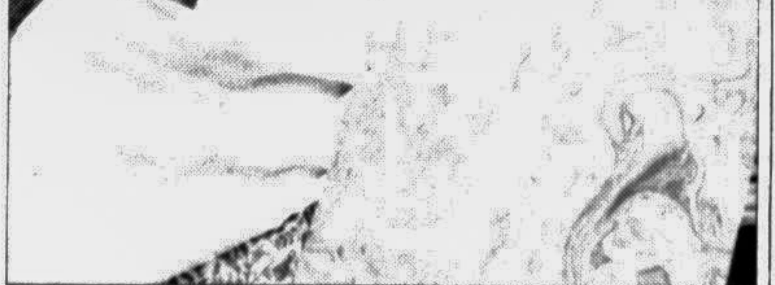
A sample of handmade paper.