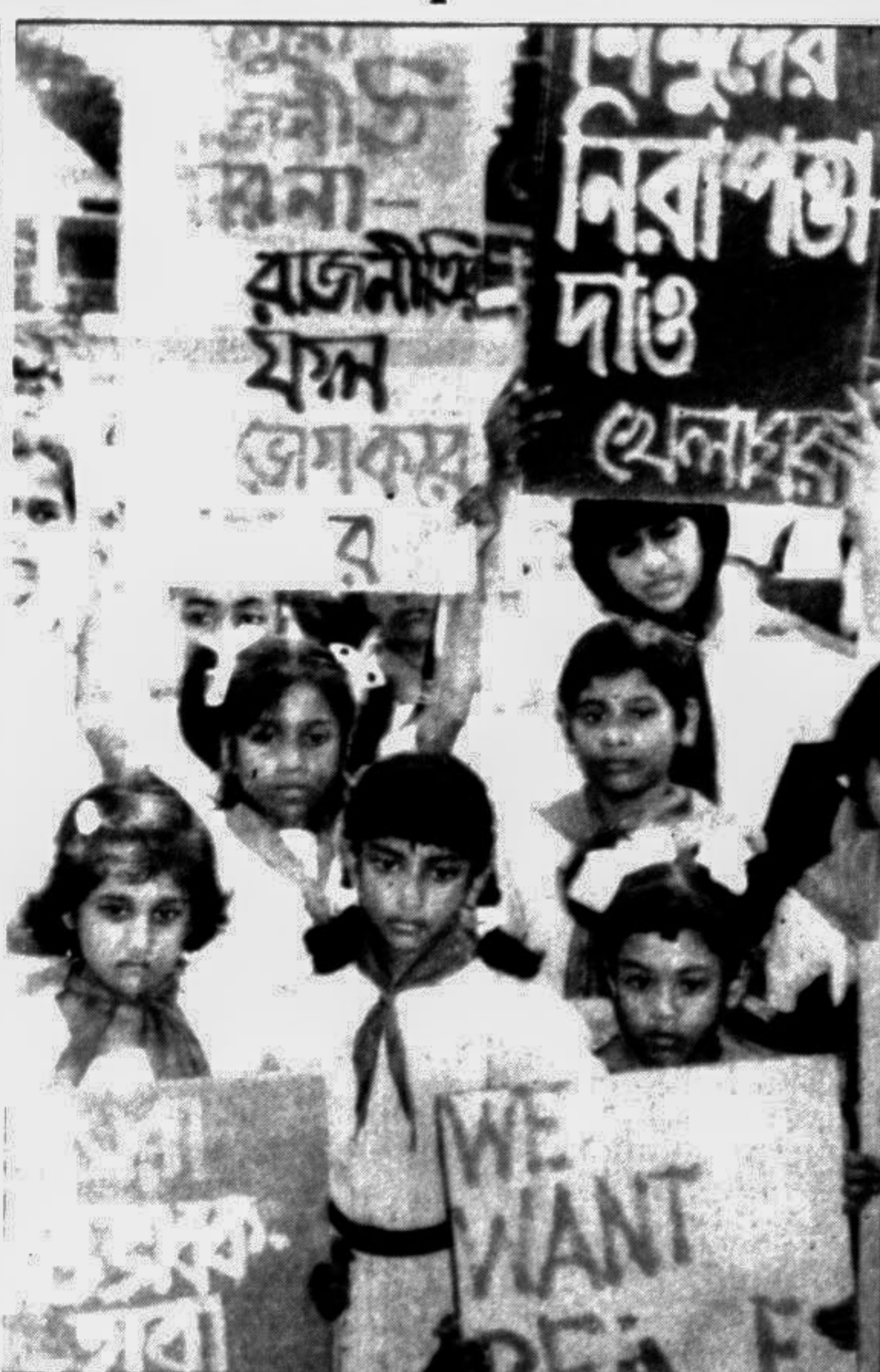
Kendriyo Khelaghar Asar brought out a rally against communalism and fundamentalism in the city yesterday.