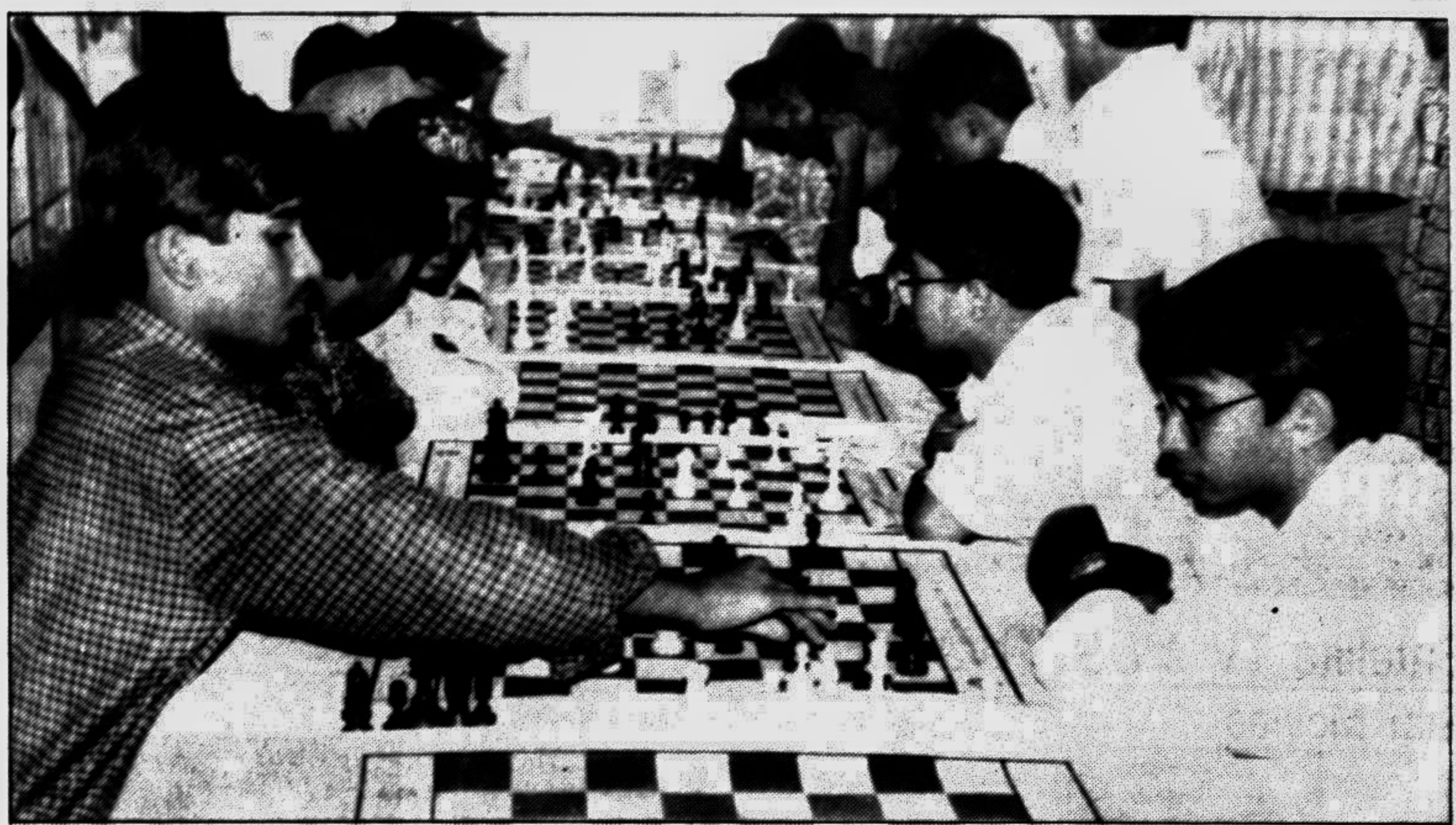
Scene from the 12th schools chess tournament at the NSC chess room yesterday.

The second round of the losers of the first round will begin this morning at 10 am while the winners and others who have drawn their first round matches will engage in the second round from 3 pm this afternoon.