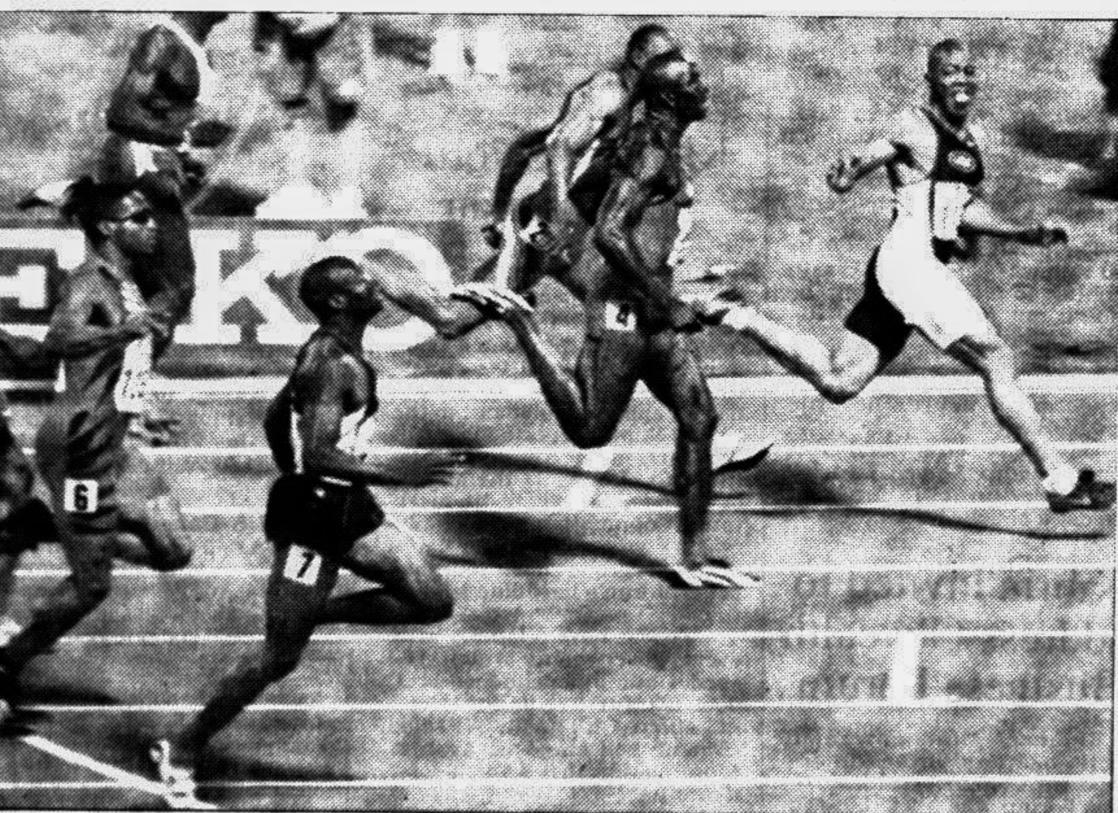
American Maurice Greene (R) storms ahead of his rivals to claim the world 100 metres title in Athens on Aug 3. Defending champion Donovan Bailey (C) of Canada finished second.

A three-day martial arts competition began yesterday at the National Sports Council gymnasium organised by the Bangladesh Martial Art Confederation (BMAC), reports BSS.