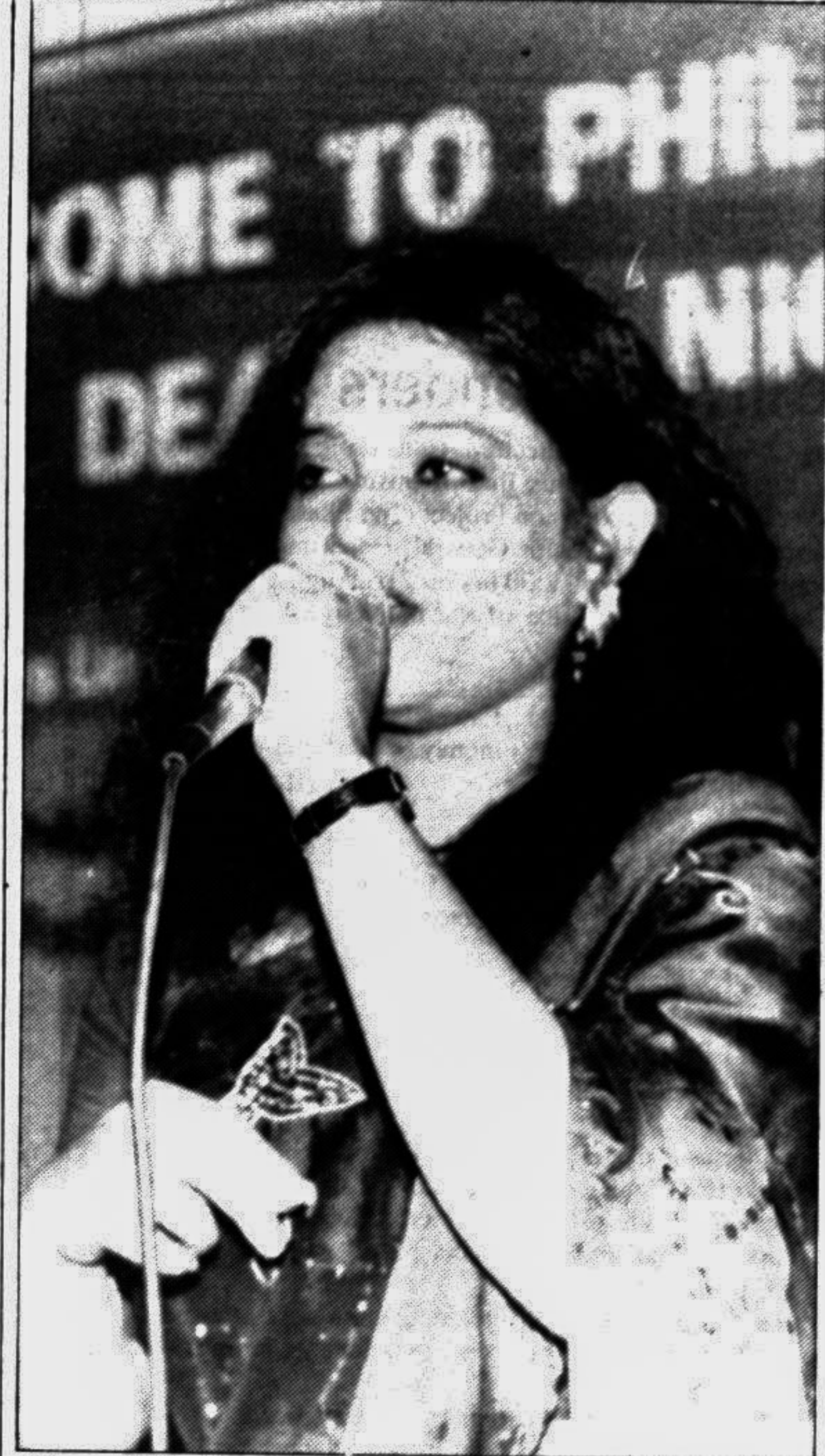
Singer Doly Sayantoni performing at the Philips Light Dealers Night 1997 at Sonargaon Hotel yesterday.