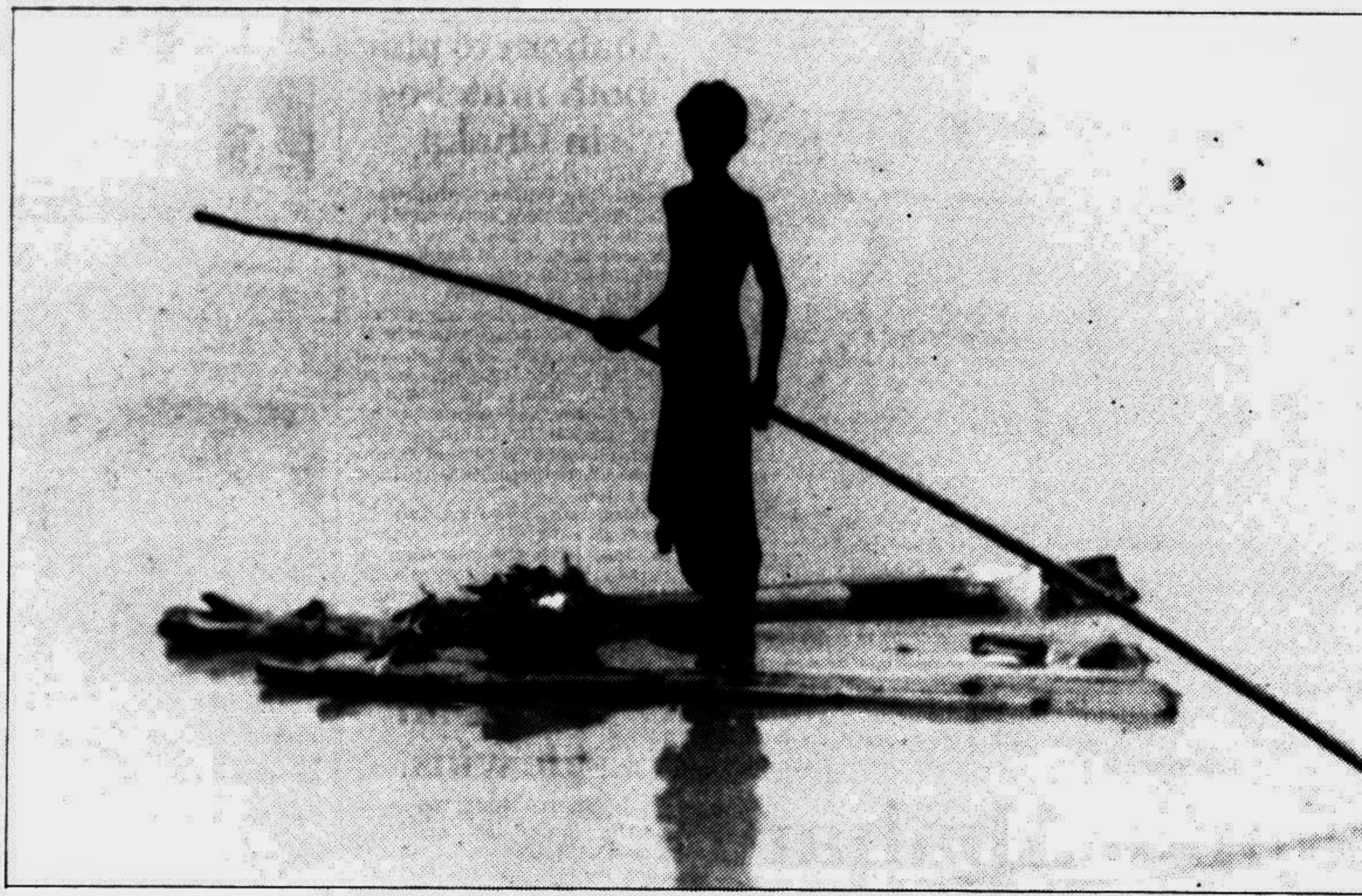
GAIBANDHA: A rural boy of flood affected Fulchhari thana in the district returning to his temporary shelter after plucking leaf from jute plants ( Patshak ). It is his daily food now.

Under the programme, constructions and re-constructions of roads, bridges and dak banglows will be executed in the district.