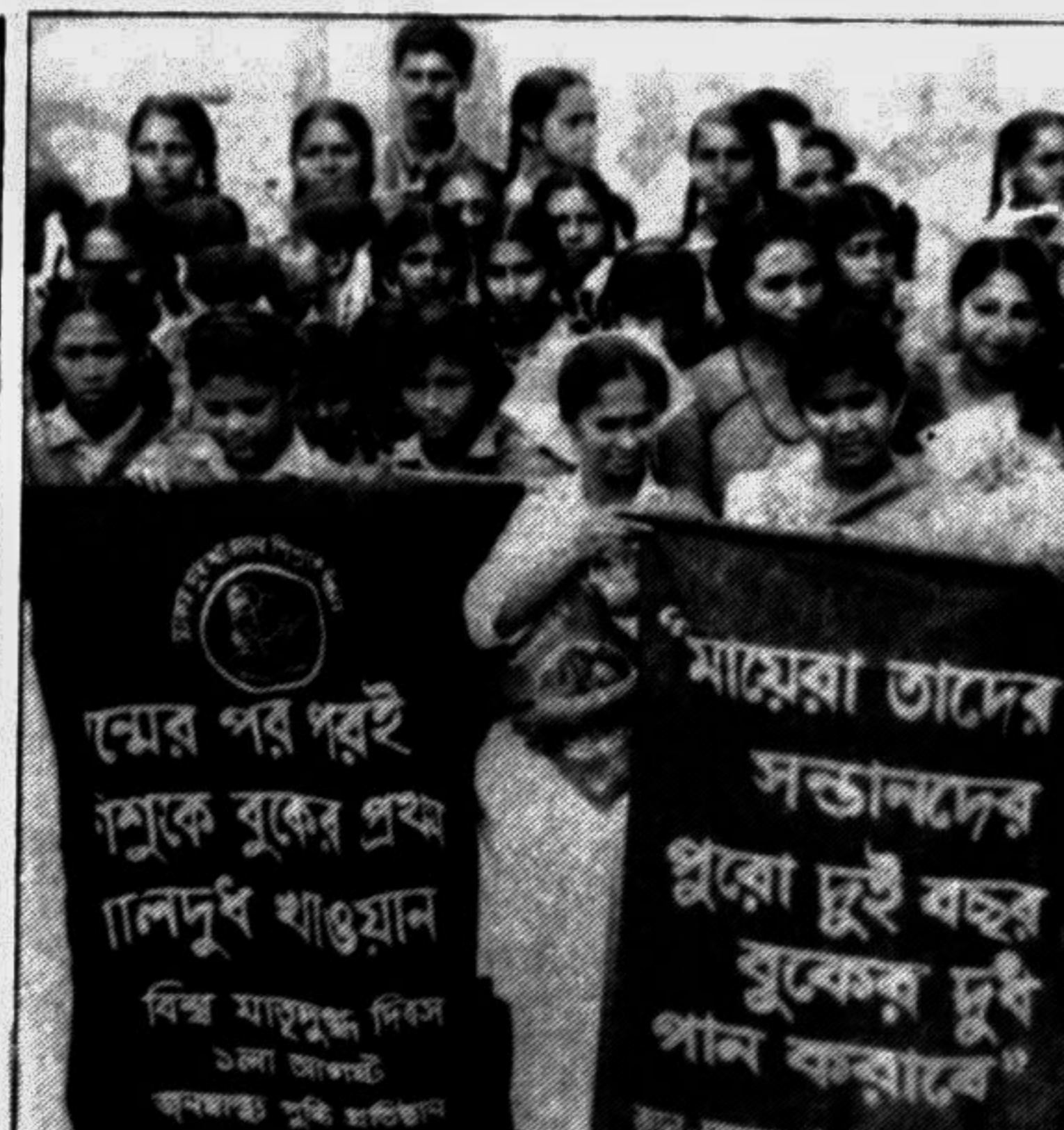
Bangladesh Breastfeeding Foundation brought out a rally on the occasion of World Breastfeeding Week in the city yesterday.

Call to implement 5th Wage Board Award immediately A meeting of the executive committee of Bangladesh Federal Union of Journalists (BFUJ) in Bogra yesterday called upon the managements of different newspapers and news agencies of the country to implement the Fifth Wage Board Award with retrospective effect immediately. reports BSS.