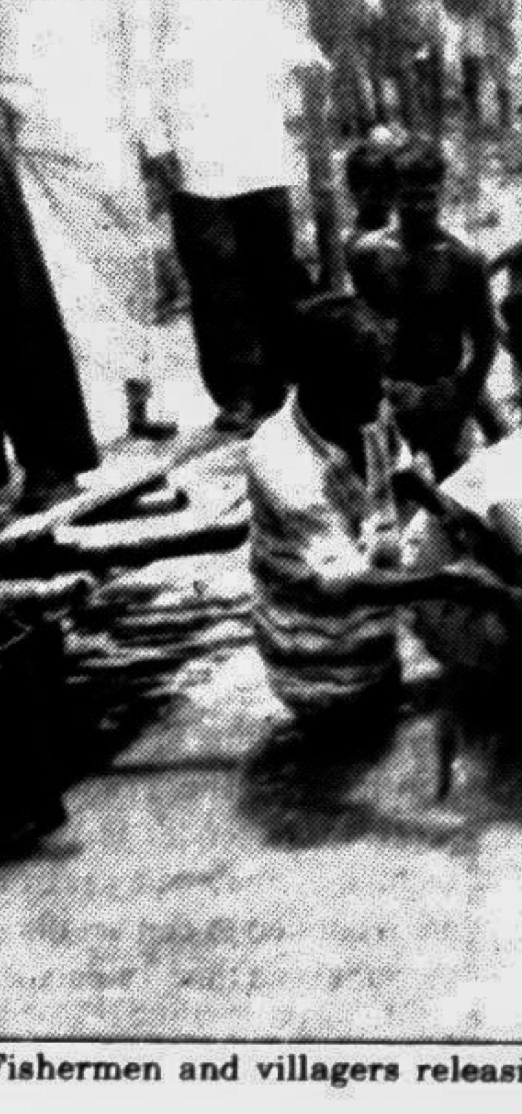
Fishermen and villagers releasing fingerlings in Borobila beel at Pargachha in Rangpur.

By Masud Arif, back from Rangpur It was like a festival for the fishermen and villagers who gathered in dozens on the bank of Borobila Beel at Pargachha in Rangpur to watch the release of fingerlings.