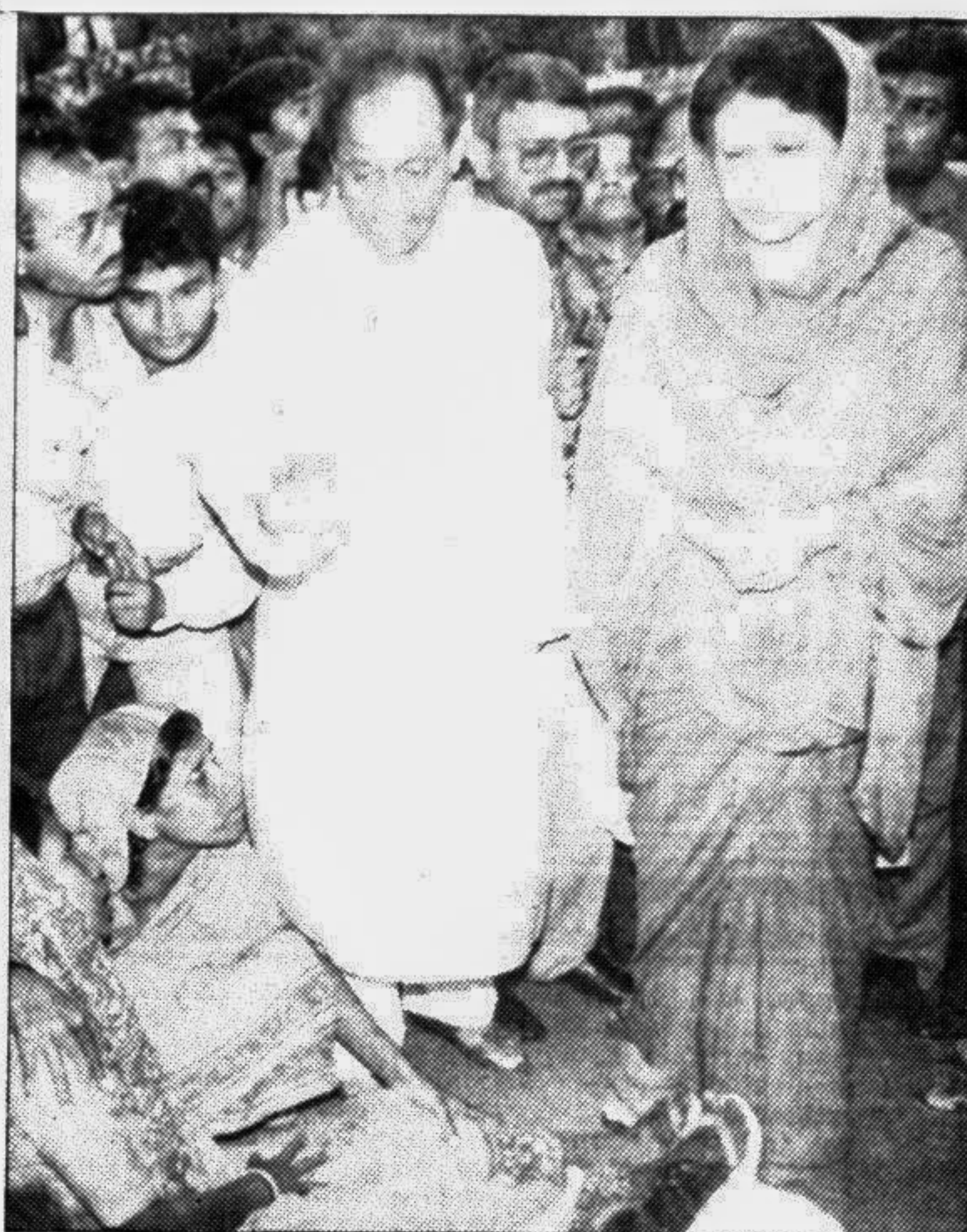
Leader of the Opposition and BNP Chairperson Khaleda Zia yesterday visited the families of garment workers killed in a stampede at a Mirpur factory complex on Wednesday.