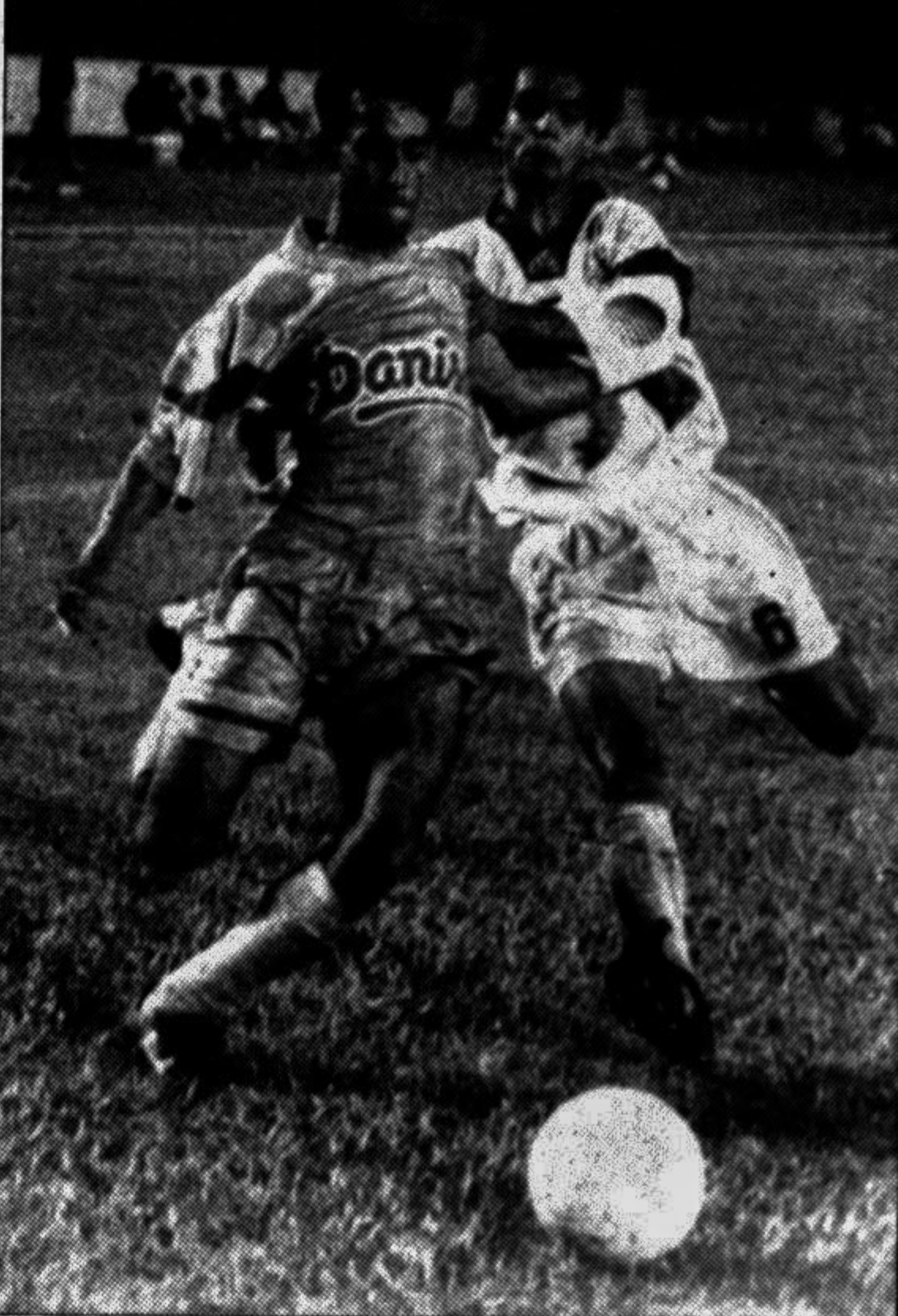
Action from the 14th Federation Cup football match between Abahani and BRTC at the Mirpur Stadium yesterday. Abahani won 3-1.