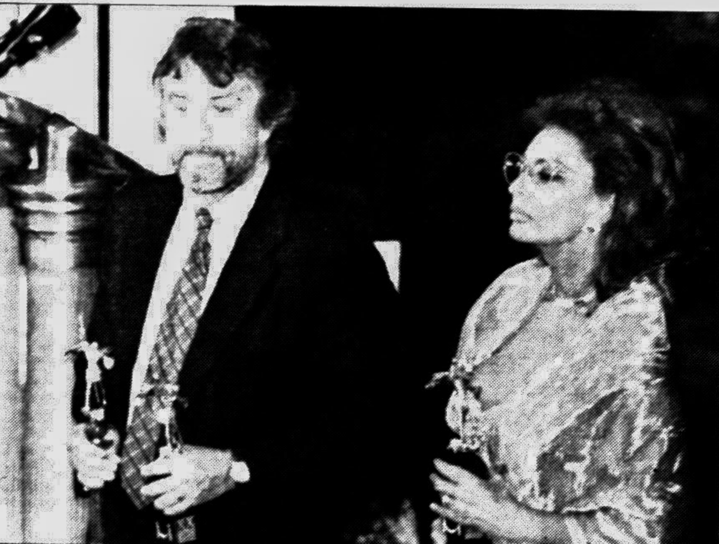
US actor Robert De Niro and Italian actress Sofia Loren stand on stage during the awarding ceremony of the 20th Moscow International Film Festival in Moscow Tuesday, where they were both awarded for lifetime achievement. De Niro was also awarded for his role of actor and producer of the film "Marvin's Room."