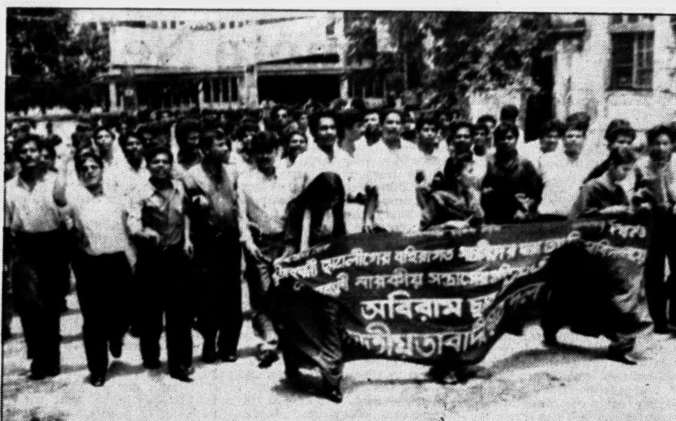
Jatiyatabadi Chhatra Dal brought out a procession on the Dhaka University campus on the second day of strike yesterday.

Thirty representatives from 17 countries of the Asia-Pacific region and 30 representatives from host Bangladesh took part in the conference.