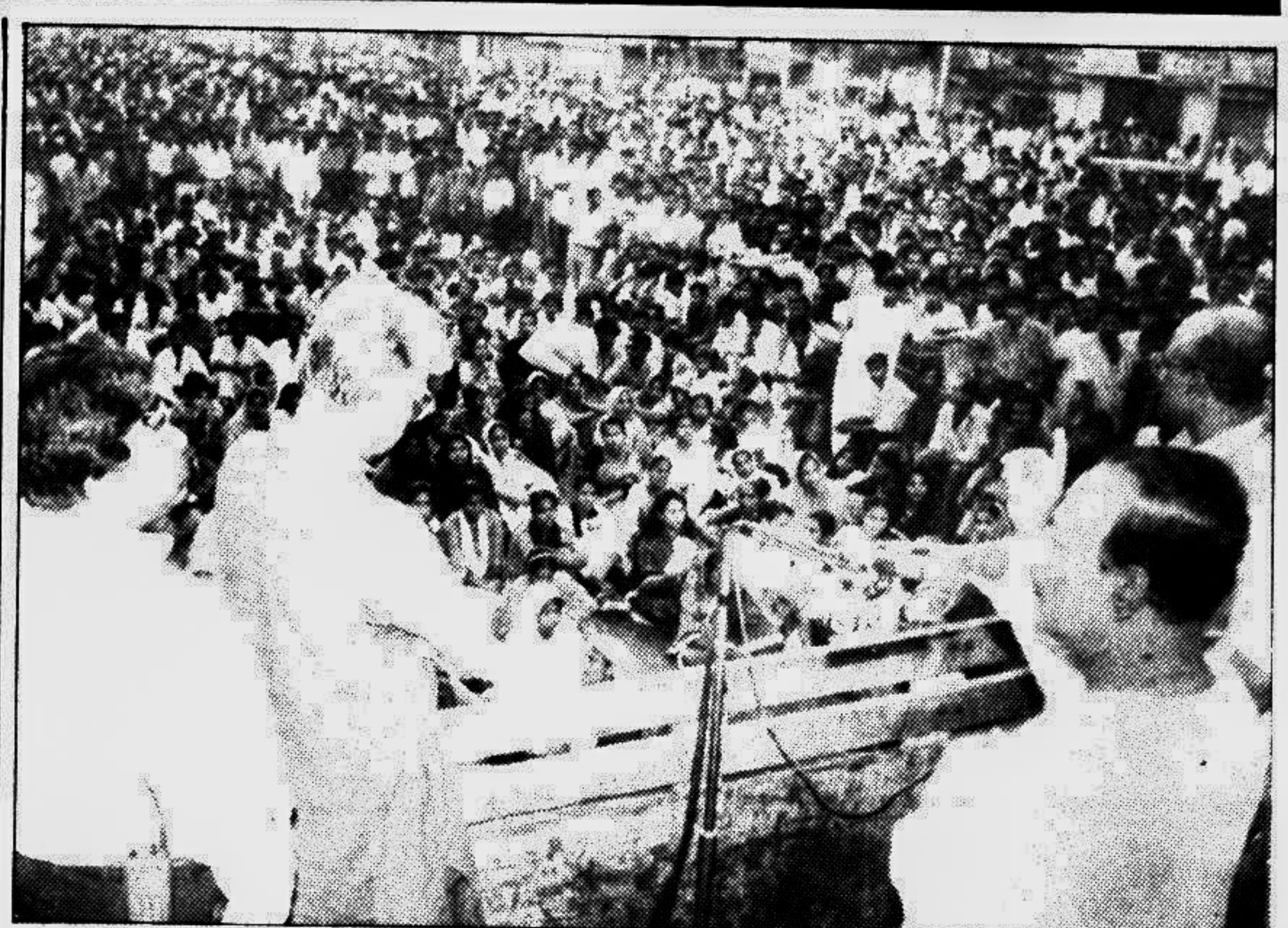
BNP Secretary General Abdul Mannan Bhuiyan addressing a protest rally in front of the party central office in the city yesterday.