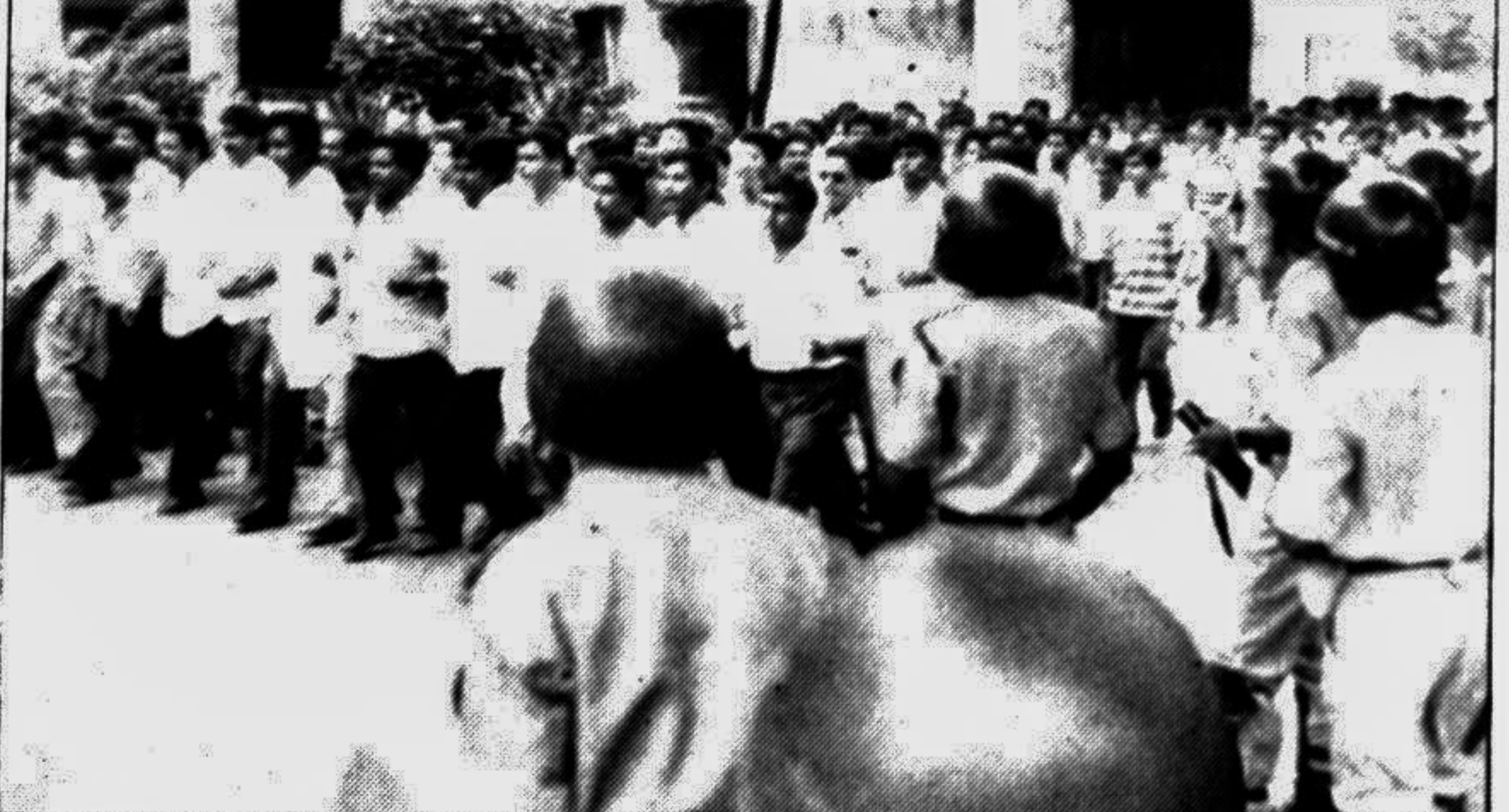
A JCD procession on the Dhaka University campus during the strike yesterday.